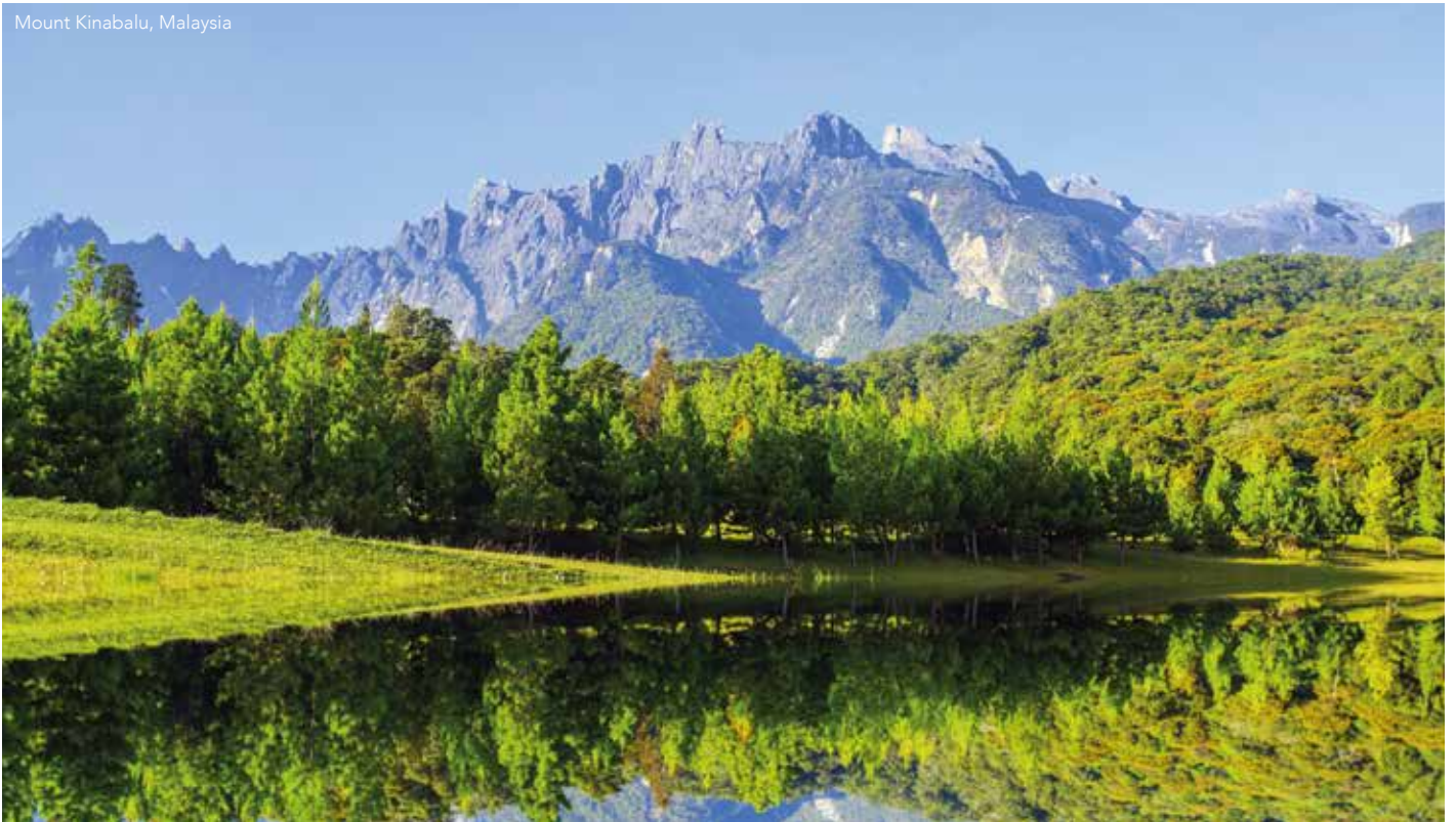
Mount Kinabalu, Malaysia

Never far from our minds will be the writings of Conrad and the adventures of James Brooke and the White Rajahs as we journey around the islands, rivers and jungles of Borneo. The privilege of exploring this remarkable land from a small ship and in the company of just 100-fellow passengers, a knowledgeable onboard team and local guides is an opportunity not to be missed. Our voyage will be so much more than a holiday, it promises to be an adventure shared with like-minded travellers.