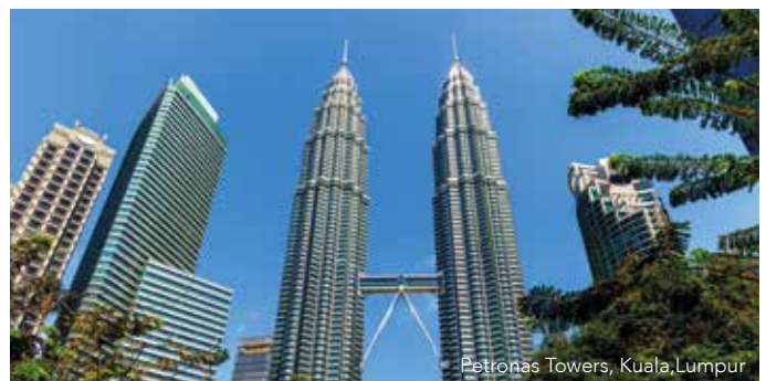
Petronas Towers, Kuala Lumpur

*Please note that the 30th July departure operates in the reverse direction from Singapore to Kuala Lumpur. Full itinerary can be viewed online.