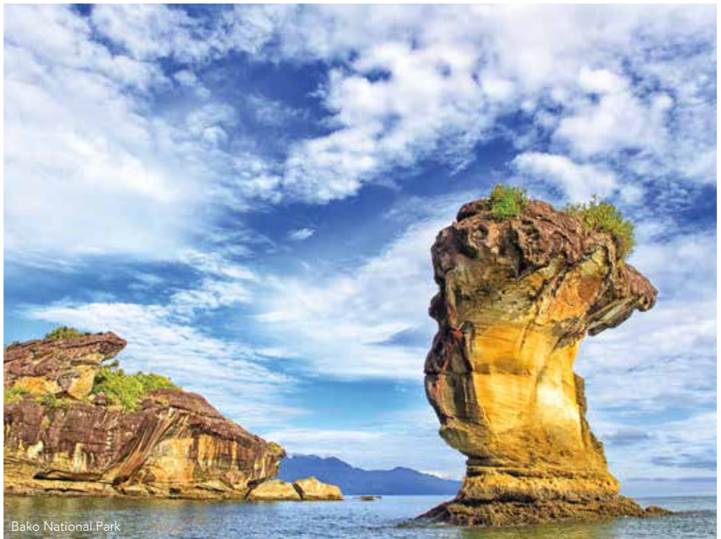
Bako National Park