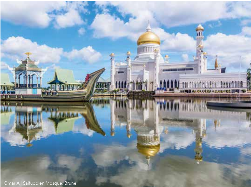
Omar Ali Saifuddien Mosque, Brunei