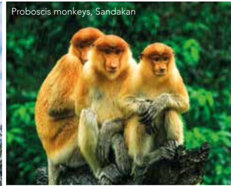
Proboscis monkeys, Sandakan