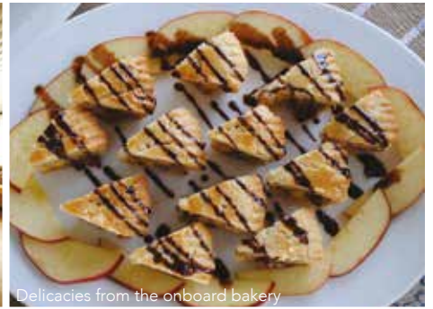
Delicacies from the onboard bakery