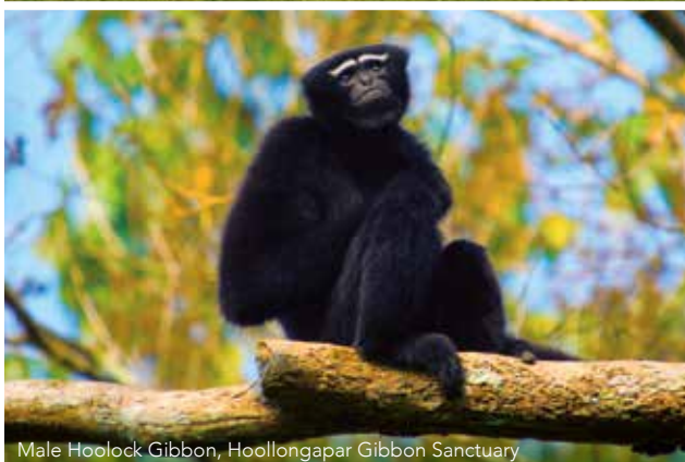
Male Hoolock Gibbon, Hoollongapar Gibbon Sanctuary