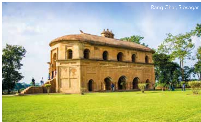
Rang Ghar, Sibsagar