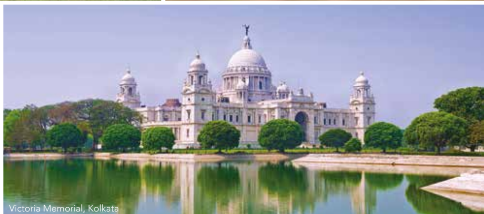
Victoria Memorial, Kolkata