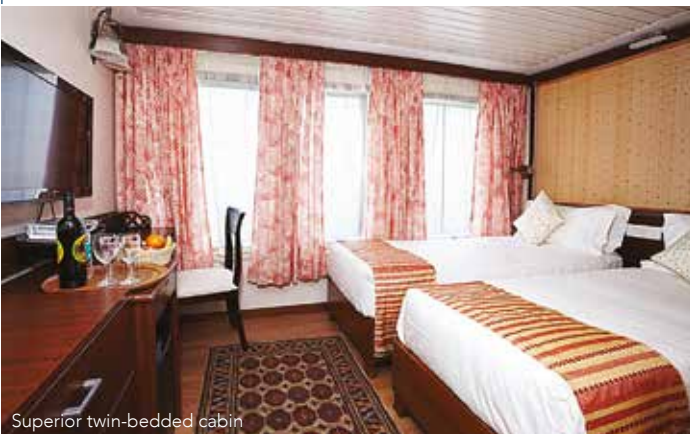
Superior twin-bedded cabin