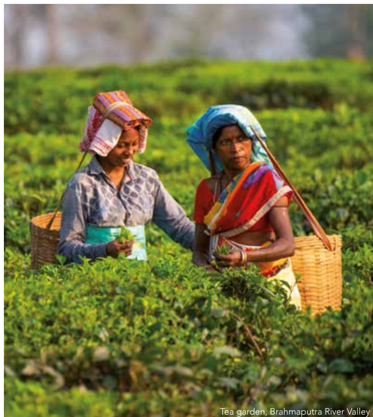
Tea garden, Brahmaputra River Valley