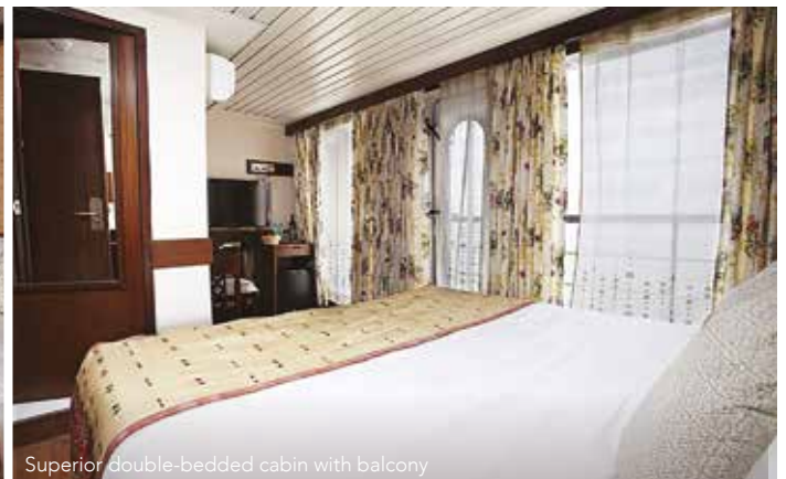
Superior double-bedded cabin with balcony

For our exploration of Assam and the great Brahmaputra River we have chartered the MV Mahabaahu, a stylish and elegant vessel which accommodates 46 guests. The vessel has a total of five decks and facilities include a swimming pool, spa and restaurant and an open top deck from where you can watch the busy life of the waterside villages pass by as well as watch for wildlife.