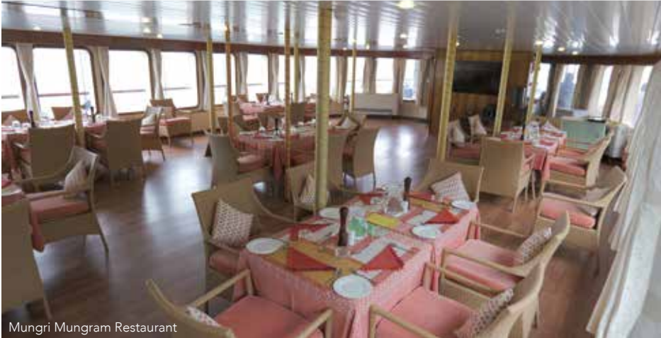
Mungri Mungram Restaurant