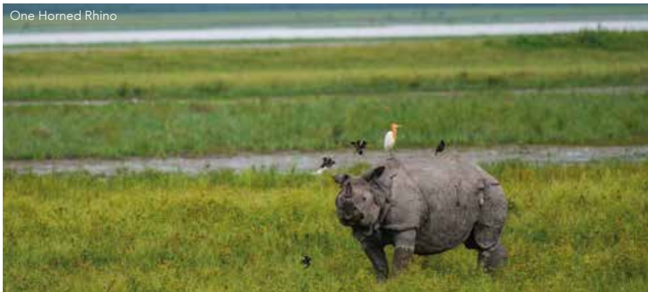
One Horned Rhino