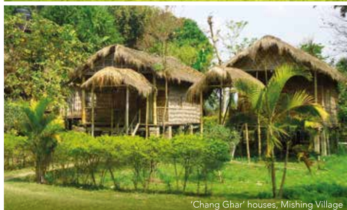
'Chang Ghar' houses, Mishing Village

Day 10 Kaziranga National Park. Today is another early start as we head out to one of the finest examples of conservation and ecology in India, Kaziranga National Park. The sighting of one-horned rhino within the park is remarkably common and, during our two safaris, we will be given the very best chance of getting close to all of Kaziranga's endemic wildlife. While the rhinos themselves are reason enough to visit, the park is home to multiple mammals, reptiles and birds including wild elephants, hog deer, crested serpent eagles and of course, the Bengal tiger. We will explore the Central and Western Ranges with lunch in the park before returning to the ship in Silghat.