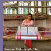
Weaver, Bishwanath Ghat

"For our exploration of the Brahmaputra River we have chartered the MV Mahabaahu, whose operators have a long-established presence in Assam and a wealth of local expertise. We have designed the itinerary around an eleven night cruise in order to offer the intrepid traveller a comprehensive visit to this remarkable region with visits to a number of National Parks. The MV Mahabaahu offers considerable comfort across all five of her decks and her size, facilities and refinement set her apart from many of the cruise ships in this region. When not ashore sightseeing or spotting some of India's finest wildlife you can take a dip in the pool, enjoy a massage treatment or simply relax on the top deck whilst watching life unfold on the riverbank."