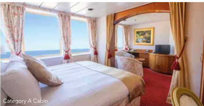
Category A Cabin

Ships of all different sizes and styles can make the selection of a cruise a somewhat hit and miss affair, and whilst some companies attempt to please everybody, we prefer to continue with our focus on small ships and to that end are delighted to have once again chartered the 50-passenger MS Monet for a series of fascinating cruises in the Adriatic and Aegean. Originally built in 1970, the MS Monet is a 220 foot motor yacht and was converted and launched as a passenger ship in 1998, fully renovated in 2016 and upgraded again in 2018. If you find large resort style vessels accommodating many thousands of passengers attractive then of course this isn't the vessel for you. However, if you prefer an informal and warm atmosphere more akin to a private yacht combined with an itinerary dedicated to both discovery and relaxation then you need look no further.