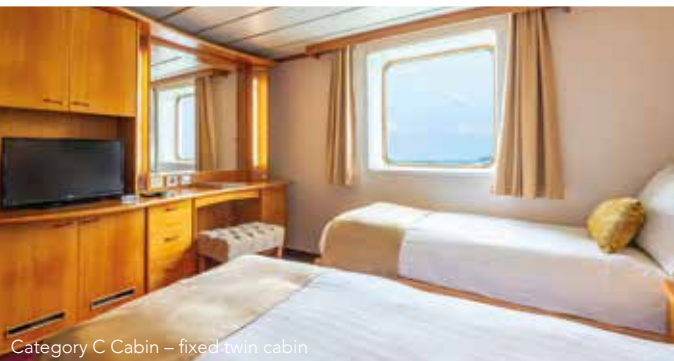
Category C Cabin – fixed twin cabin

Located on the Parisian Deck, the glass enclosed indoor dining room seats all passengers in a single sitting with unassigned seating and allows for wonderful panoramic views of the stunning scenery as we sail. The Lumiere Open Deck provides a covered area where guests can enjoy meals al fresco on some days, weather permitting. Food is served at the table or displayed on the hot and cold buffet stands. The menu is international, with a focus on local specialties. A choice of house wine, beer and soft drinks are served with lunch and dinner.