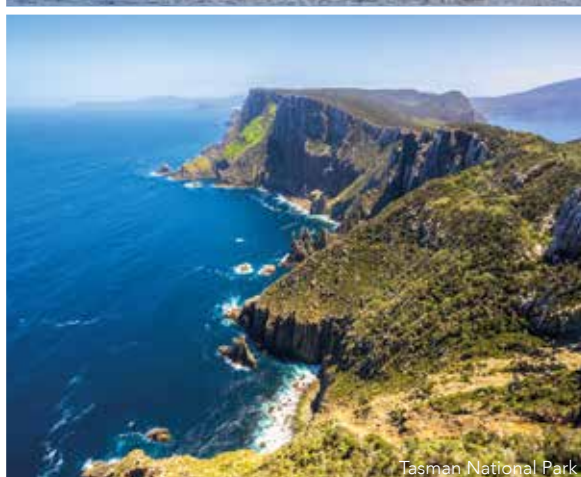
Tasman National Park

1870s to help prevent shipwrecks in a dangerous stretch of water known as the 'Eye of the Needle' and still stands guard over the ocean today. Also see the calcified forest which is made up of hundreds of weirdly shaped limestone features. The structures that make up the forest were created when calcium carbonate attached to the deep roots of coastal vegetation and have since been exposed when the surrounding sand has blown away.