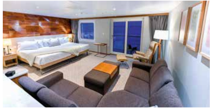
Bridge Deck Balcony Suite