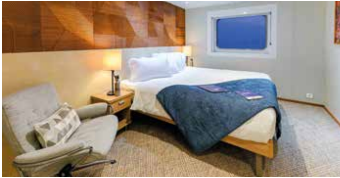
Promenade Deck Stateroom