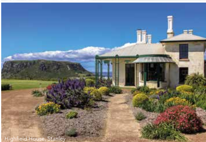
Highfield House, Stanley