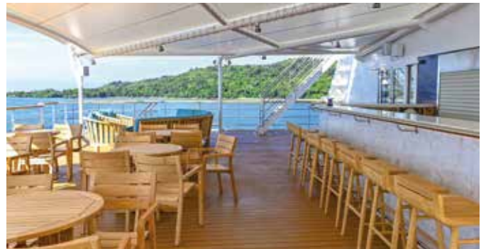
Bridge Deck & Bar