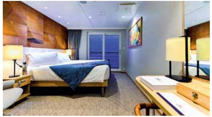
Explorer Deck Stateroom

All cabins are outside facing with ensuite bathroom, premium amenities, wardrobe, desk, armchair and many feature a private balcony allowing you to enjoy the spectacular vistas from your cabin. With the exception of the two suites on board, all staterooms feature a junior king sized bed which can be separated into twin beds. Staterooms on the Coral and Promenade Decks measure 17 square metres with those on the Coral Deck featuring portholes whilst those on the Promenade Deck feature a large picture window. Staterooms on the Explorer and Bridge Decks measure 21.4 square metres and feature a private balcony with seating for two. There are two very spacious suites on the Bridge Deck which measure 55.8 square metres and are equipped with a super king sized bed, lounge area, private balcony, minibar, personal coffee machine and a large bathroom which features a bath and separate shower.