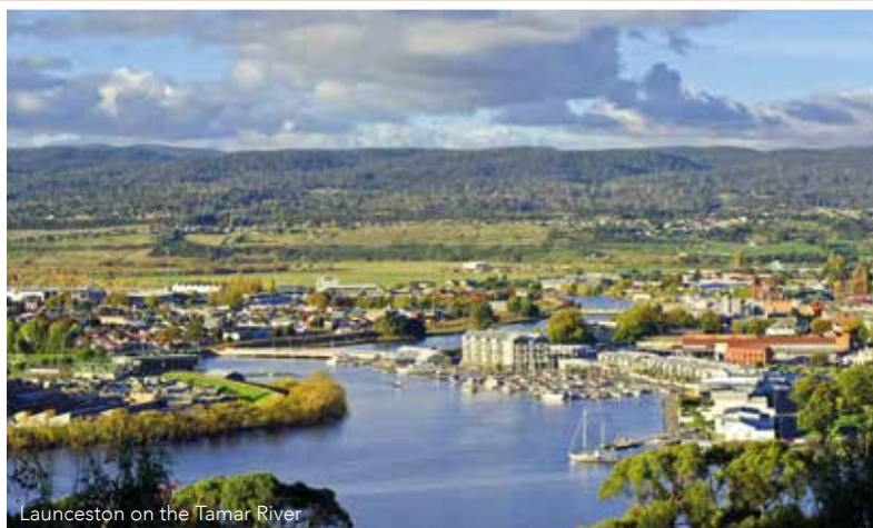
Launceston on the Tamar River

the Painted Cliffs, where rich iron deposits have stained the sandstone cliffs with coloured streaks of red, purple and orange.