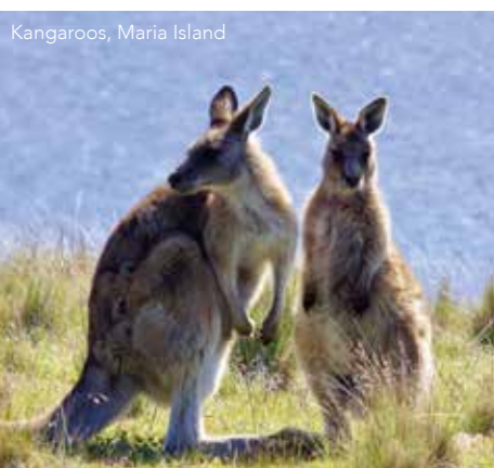
Kangaroos, Maria Island