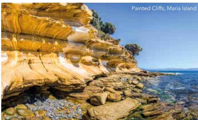
Painted Cliffs, Maria Island