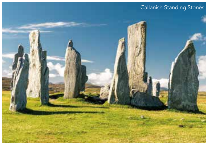
Callanish Standing Stones