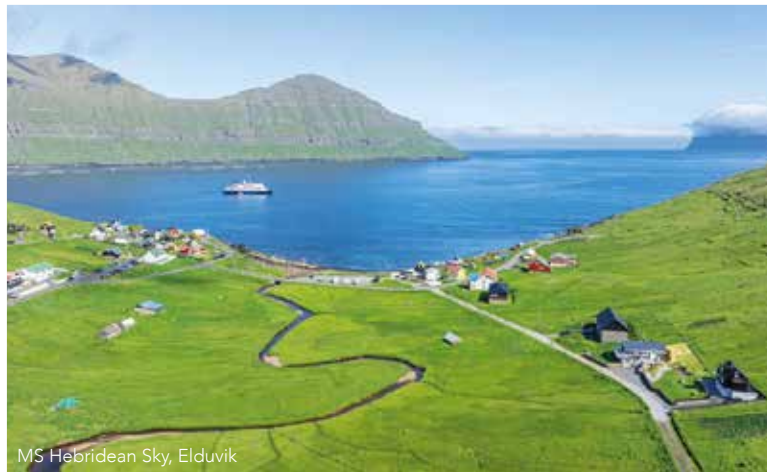
MS Hebridean Sky, Elduvik

Day 3 Lerwick. From the Shetland capital, we will visit the remarkable archaeological site of Jarlshof. The site was uncovered by a violent storm in the winter of 1896/7, revealing an extraordinary settlement site embracing at least 5000 years of human history. The site contains a remarkable sequence of stone structures – late Neolithic houses, a Bronze-Age village, an Iron-Age broch and wheelhouses, several Norse longhouse, a Medieval farmstead and the 16th century laird's house. Return to the ship for lunch and enjoy an afternoon at leisure to explore this historic port. Tonight we will be entertained by local musicians before sailing late in the evening.