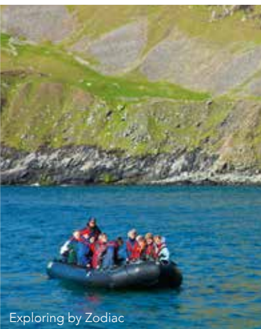
Exploring by Zodiac