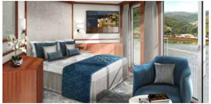
Illustration of Deluxe Cabin with French Balcony post-refurbishment