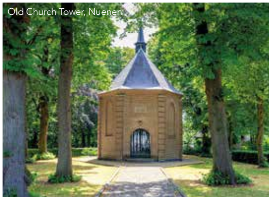
Old Church Tower, Nuenen