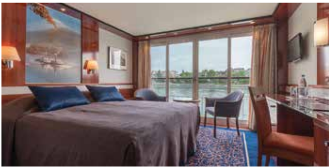
Premium Cabin with French Balcony (prior to refurbishment)