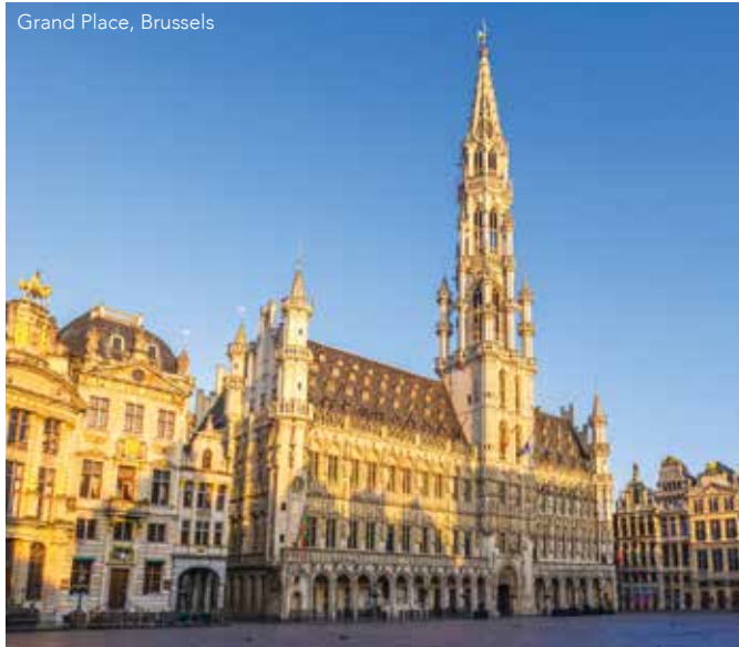
Grand Place, Brussels

Day 11 Amsterdam to London. Disembark this morning and transfer to Amsterdam Airport for our scheduled flight.