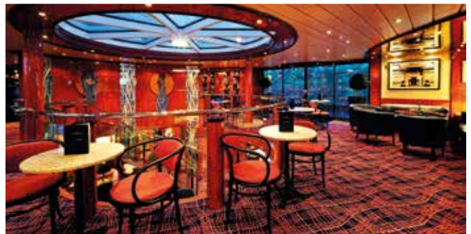
Atrium Lobby (prior to refurbishment)