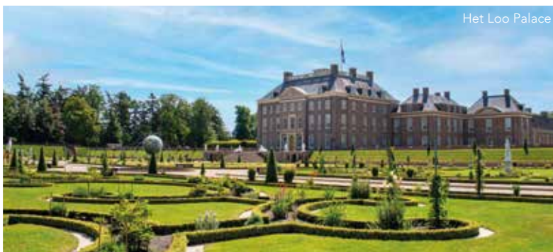
Het Loo Palace