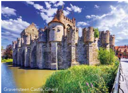
Gravensteen Castle, Ghent