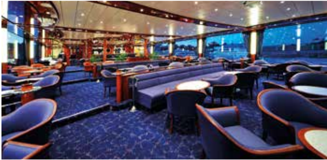
Lounge & Bar (prior to refurbishment)