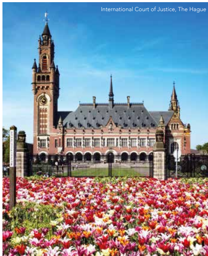
International Court of Justice, The Hague