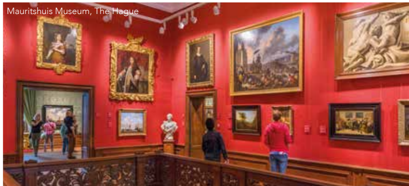
Mauritshuis Museum, The Hague