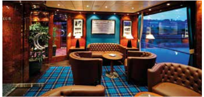
The Club (prior to refurbishment)