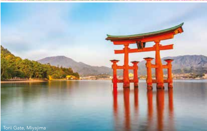
Torii Gate, Miyajima