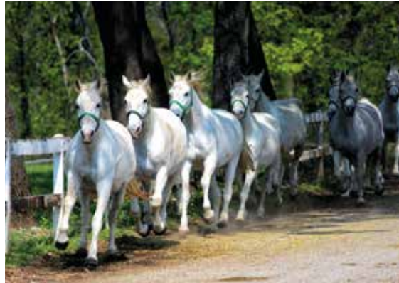
Lipizzaner performing horses at Lipica Stud Farm