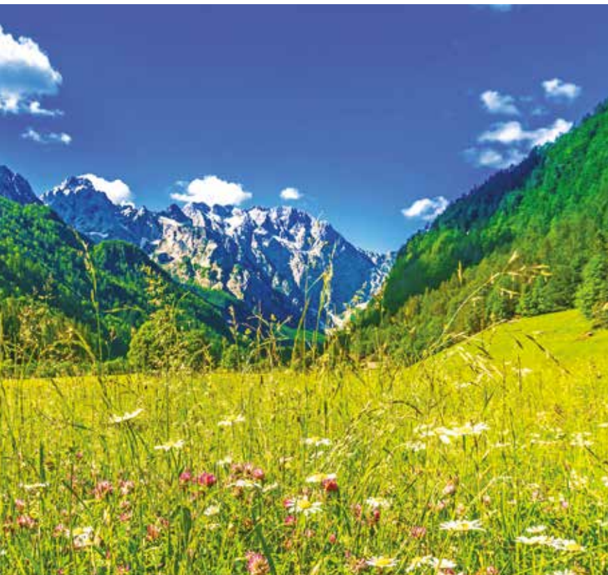
Wild flowers in the Logarska Valley meadows