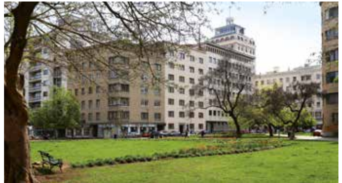
Urban Boutique Hotel exterior