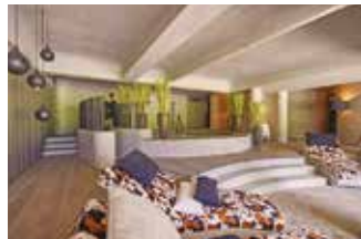
Whirlpool and Wellness Centre