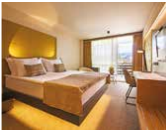
Double Room with Lake View

The Rikli Balance Hotel occupies an elevated position in the beautiful town of Bled and affords spectacular views across the lake to the castle and famous islet. Located just 100 yards from the shoreline, the hotel has easy access to both the lakefront promenade and the many nearby bars and restaurants and is the perfect base for our exploration. We will be staying in the lake view rooms with all the modern conveniences including air-conditioning, complimentary Wi-Fi, tea and coffee making facilities, TV, safe and minibar.