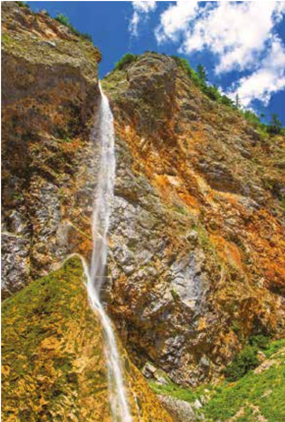
Rinka Waterfall in the Logarska Valley