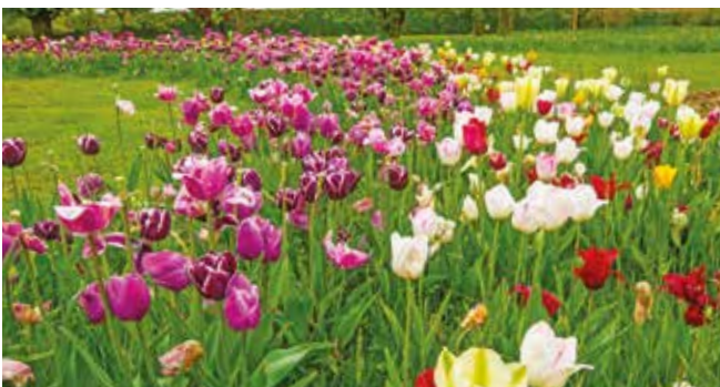
Colourful tulips, Volcji Potok Arboretum

During the course of our eight day escorted tour, we will stay in some charming properties, one with magnificent views over Lake Bled, one in the heart of Ljubljana city and the other idyllically set in the Logar Valley, one of the most beautiful Alpine glacial valleys in Europe. The itinerary will be well paced so that, when not enjoying the guided tours or exploring independently, there will be time to relax and appreciate these wonderful settings, partaking in a gentler style of tourism that suits Slovenia so well.