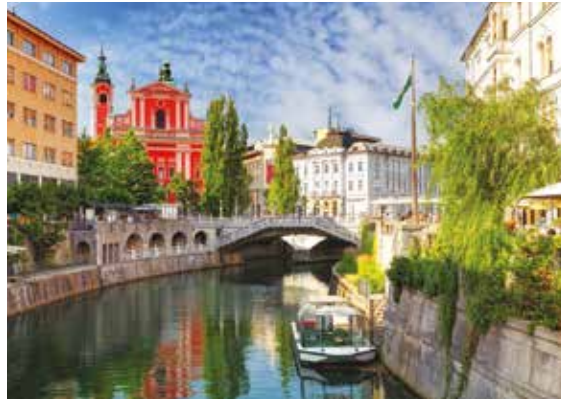
Franciscan Church of the Annunciation and the River Ljubljanica, Ljubljana