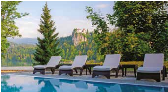
View across the lake to the castle from the pool

For our escorted tour of Slovenia we have selected some of the finest accommodation available and will be staying at the following properties: