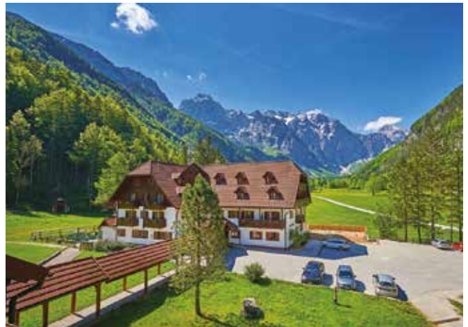
Hotel Plesnik and the Kamnik Savinja Alps