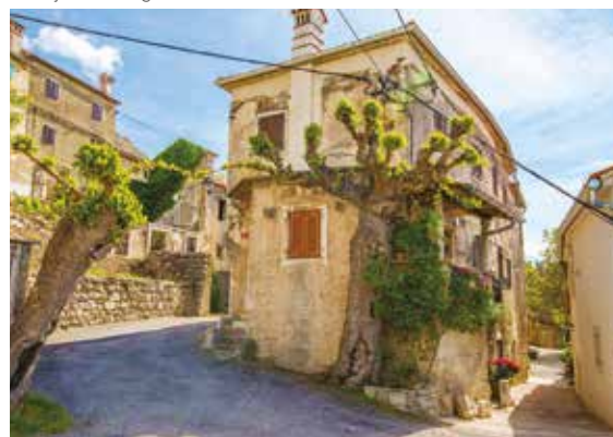
Traditional old Karst stone house, Stanjel

Once back ashore, transfer to nearby Radovljica and its beautiful Linhart Square to learn about the traditional Slovenian craft of lectar, a sweet honey-bread that is decorated by hand. Enjoy a local lunch here before returning to Bled for an afternoon and evening at leisure. (B, L)