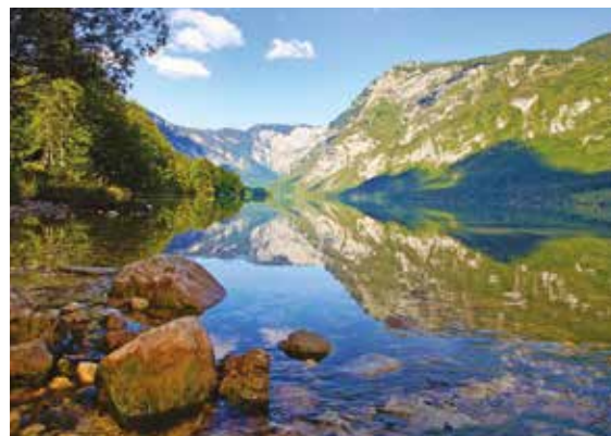
Bohinj Lake in Triglav National Park