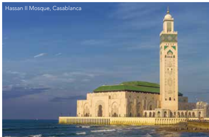
Hassan II Mosque, Casablanca