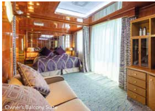
Owner's Balcony Suite