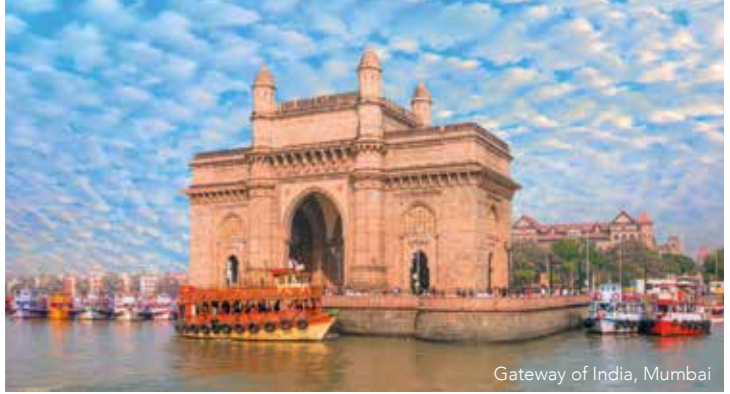
Gateway of India, Mumbai

include the serene Kerala backwaters at Alleppey where we will board a local boat for a cruise past colonial warehouses and coconut thatched houses. For centuries, these canals provided a safe and efficient means of transportation for goods and people moving between the heartland of Kerala and the port towns along the coast. Even today, traditional barges, or kettuvallams, haul coconut, pepper, rice and other goods along the waterways. We will also spend time in Cochin to explore the diverse mix of cultures and religions that together, with its strong trading past in spices and silks, make for a fascinating city. Discover Mattancherry Palace with its ornately decorated rooms including some marvellous ancient murals and see the oldest European church in India, St Francis, and the ruins of the fort. On our first evening as we moor overnight, we will enjoy a Kathakali performance on board after dinner. Based on the subject from the Ramayana, Mahabharata and stories from Saiva literature, Kathakali is one of the main forms of classical dance drama of India and indigenous to Kerala.