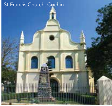
St Francis Church, Cochin