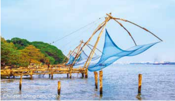
Chinese fishing nets, Cochin