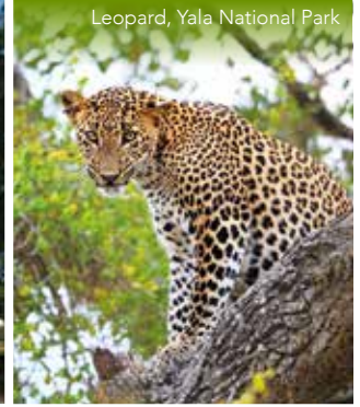
Leopard, Yala National Park