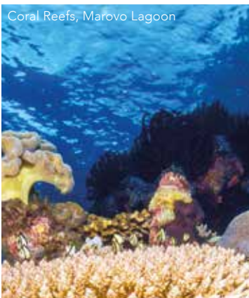
Coral Reefs, Marovo Lagoon