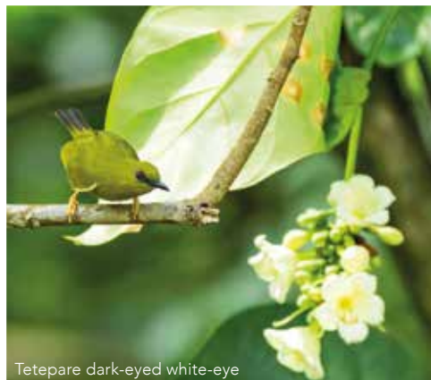
Tetepare dark-eyed white-eye