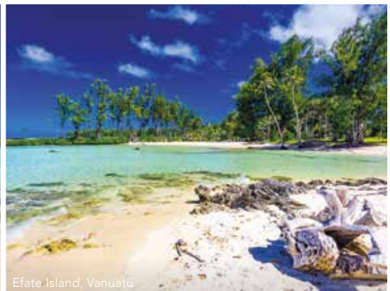
Efate Island, Vanuatu