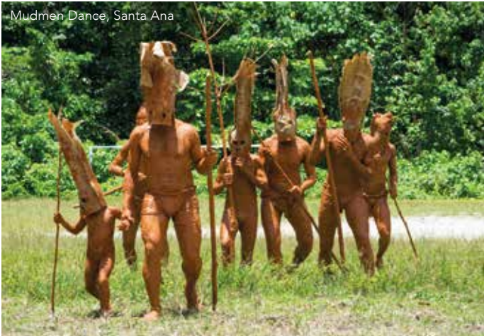
Mudmen Dance, Santa Ana