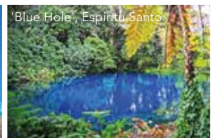
'Blue Hole' - Espiritu Santo