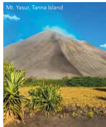
Mt. Yasur, Tanna Island

Tanna Island, Vanuatu: This spectacular island is home to constantly burping Yassur, a volcano located in the middle of lush tropical rainforest with the occasional small village. We anchored cautiously just outside Resolution Bay. There was a gentle roll filtering into the fairly open bay, forming a slight break on the beach and on arrival the band started up some tropical tunes. The recent wet season rains had turned the jungle even greener than usual and the first section included the flats which were dominated mainly by planted guava and coconut. As we bounced onward and upward, the vegetation developed into simple but beautiful rainforest, dominated by strangler figs. As we drove higher, tall and skinny tree ferns arched over the road. Those with good eyes noticed a number of 'Tanna Fruit-Doves', plump green birds that flicked between trees in the canopy. The great fat lady known as Yassur was smoking continuously as we started to clamber up her rocky slopes. Once at the top we could peer into her belly. Before each explosion of sound and debris, we could see a shock wave expand out in a split second, vibrating all the particles in a wave. After the sudden shock wave, red lava and bombs were flung high into the air.