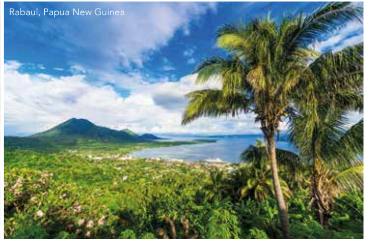
Rabaul, Papua New Guinea