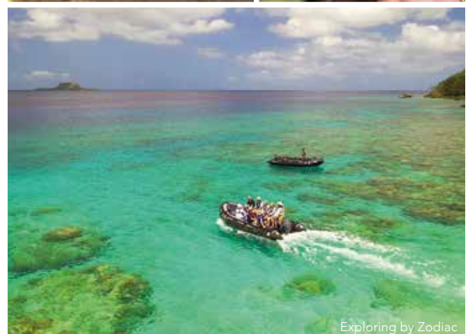
Exploring by Zodiac