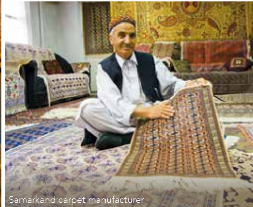
Samarkand carpet manufacturer