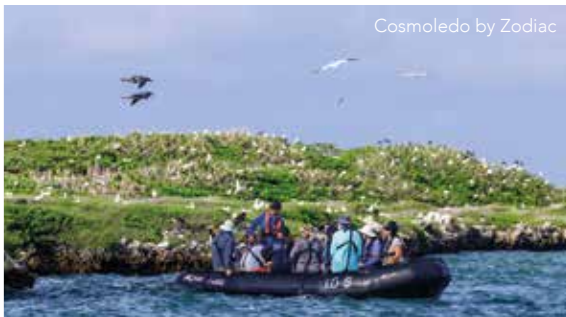
Cosmoledo by Zodiac