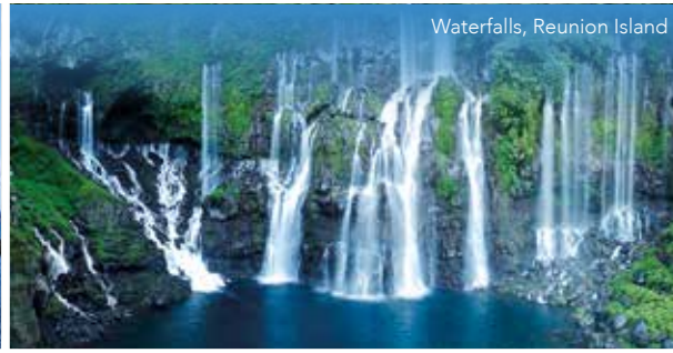
Waterfalls, Reunion Island