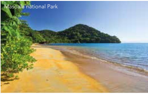
Masoala national Park