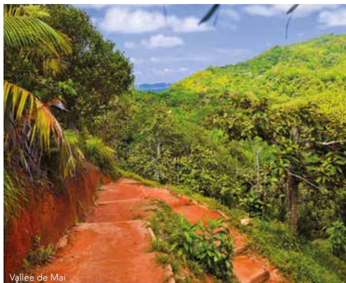
Vallee de Mai

Day 3 Praslin & Curieuse, Inner Seychelles. Spend the morning on Praslin where we will explore the 'Vallee de Mai', the last remnant of the original high canopied Seychelles palm forest and home to the coco de mer. We will walk its paths looking out for the rare black parrot and enjoying its natural beauty. Sail over lunch to Curieuse, a rugged island that was once home to a leper colony and now houses an eco-museum and visitor centre. The island is an important nesting site for hawksbill turtles and boasts endemic vines and mangroves which we will explore during our island walk.