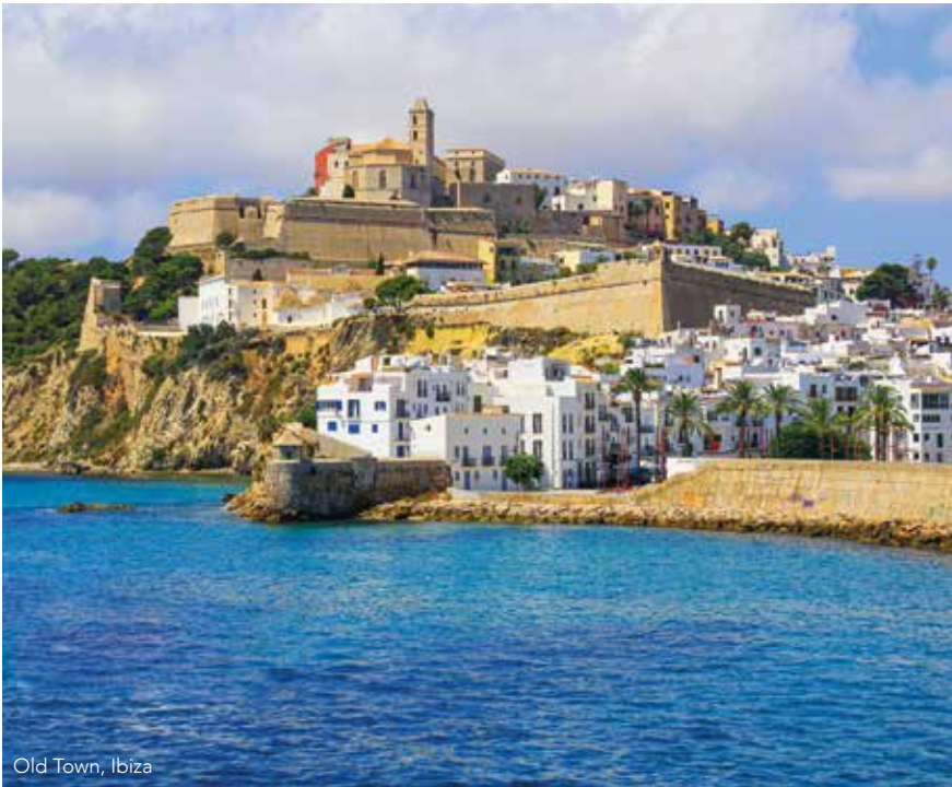
Old Town, Ibiza