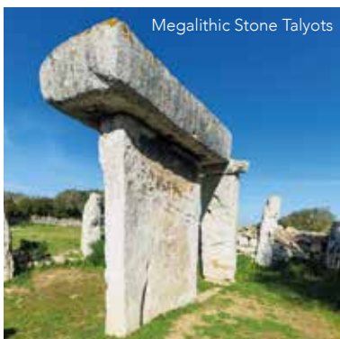
Megalithic Stone Talyots