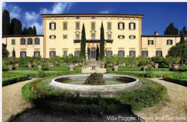
Villa Poggio Torselli and Gardens

After disembarking the MS Hebridean Sky we are offering a two night extension in the beautiful city of Florence staying at the wonderful Grand Hotel Baglioni.