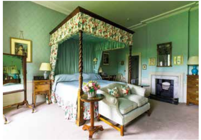
Four-Poster Room, Main House

Three charming suites offer the comfort of the hotel with a greater degree of privacy. The Garden Suite is located in Middlethorpe Court, approximately 60 metres from the main building and has a parking space and patio garden. It contains a dining/sitting room, two bedrooms (one with a king-size bed and one with a single) and a kitchen. The Cottage Suites are located in a Victorian cottage with its own garden just 50 metres from the main house. They are accessed on the ground and first floors, which can inter-connect if required. The ground floor suite has a queen-size bed, while the first floor suite has a queen-size bed and a single bedroom, and both have sitting rooms and tea/coffee making facilities.