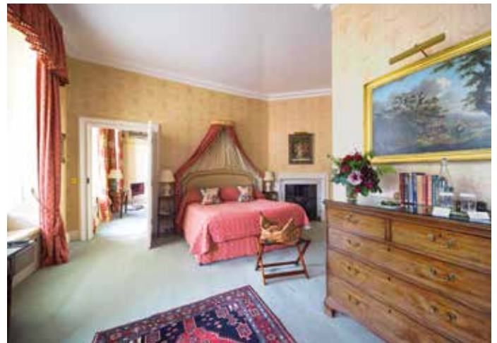
White Rose Suite