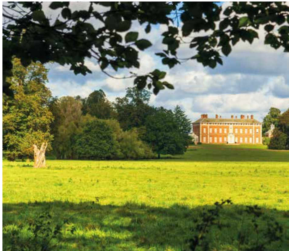
Beningbrough Hall & Park