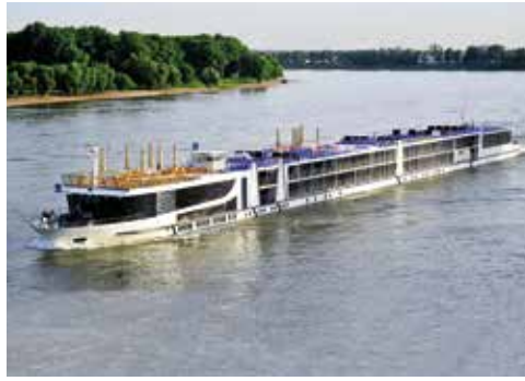
MS River Crown