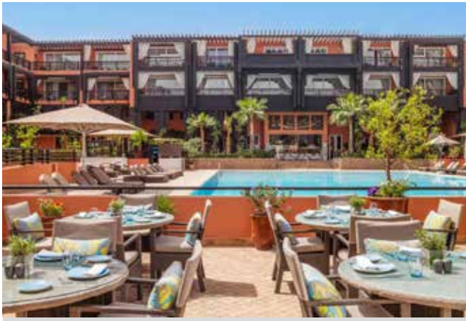
Le Naoura Barriere Marrakech

At the gates of the Medina and a few minutes from the souks and Jemaa El-Fna Square, Le Naoura Barriere offers absolute tranquillity in its beautifully landscaped gardens. The bright, welcoming interior design blends perfectly with the traditional styled architecture. The spacious bedrooms measure 46 square metres and blend Marrakech finesse with French luxury. The rooms are all equipped with modern comforts including TV, air-conditioning and Wi-Fi along with a private terrace. At the heart of the hotel sits a large heated outdoor pool, with luxurious padded sun loungers and parasols along with its spa and wellness centre where you can pamper body and mind. The property boasts two restaurants, the first offering French cuisine with a Moroccan twist and the second providing outside dining with Moroccan and Mediterranean dishes. The hotel's bar and lounge provide a chic setting for cocktails and light snacks. This wonderful hotel makes the ideal first stop in Morocco from which to rest and relax as well as explore Marrakech's prominent sights.