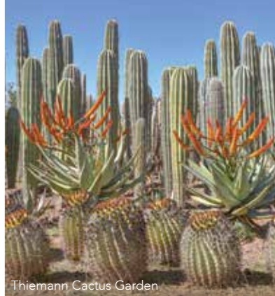
Thiemann Cactus Garden