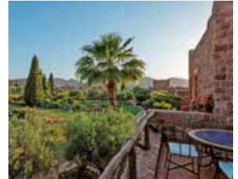
Superior Room Terrace