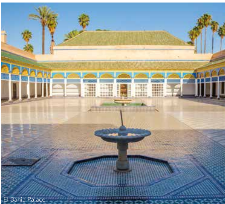
El Bahia Palace

During the course of seven nights we will stay in two delightful properties, a luxury hotel in Marrakech and a kasbah in the Atlas Mountains, enjoy some fantastic cuisine and take an in-depth look at this exotic land. Looking out over the mountain and desert landscapes, exploring dramatic gorges, viewing delightful gardens and art galleries, and immersing yourself in the colourful souks in Marrakech is the perfect escape from modern life. Throughout the week we will be accompanied by a local guide with extensive knowledge of the local plant life who will escort our visits to the region's most alluring gardens.