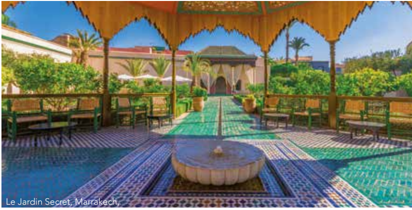
Le Jardin Secret, Marrakech