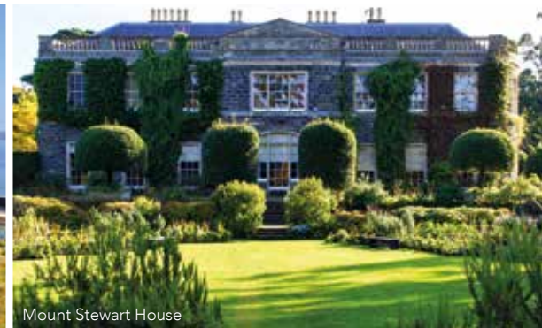
Mount Stewart House