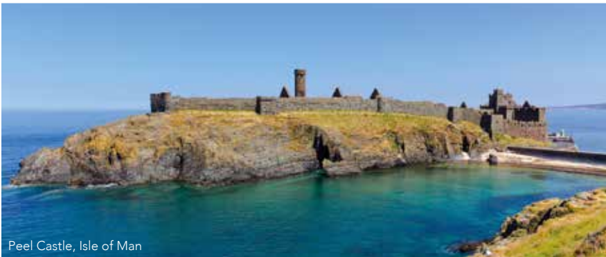
Peel Castle, Isle of Man