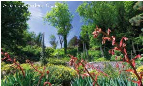
Achamore Gardens, Gigha