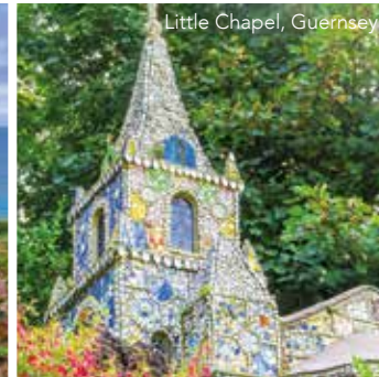
Little Chapel, Guernsey