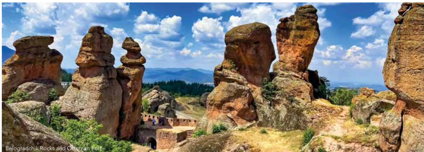
Belogradchik Rocks and Ottoman Fort