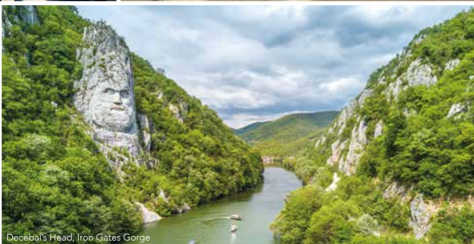
Decebal's Head, Iron Gates Gorge

spot. The sandstone has been weathered into all manner of bizarre shapes, and housed amongst the rocks is an Ottoman fort, built on the remains of a Roman structure. Return to the ship for lunch and this afternoon we visit Vidin for a performance by the wonderful Vidin Symphonic Orchestra in the Philharmonic concert hall.