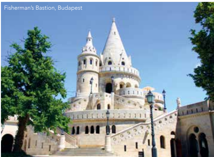
Fisherman's Bastion, Budapest