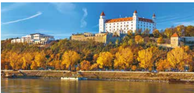
Bratislava Castle, Parliament and Danube River, Bratislava

Day 5 Christmas Day on the Danube. A relaxing day as we enjoy the good food and festivities of Christmas Day on board.