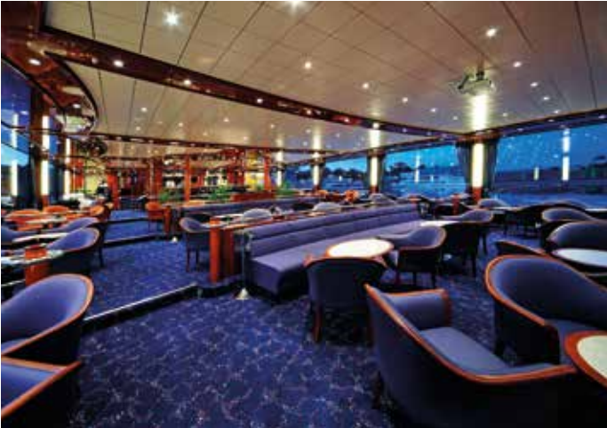
Lounge & Bar (prior to refurbishment)