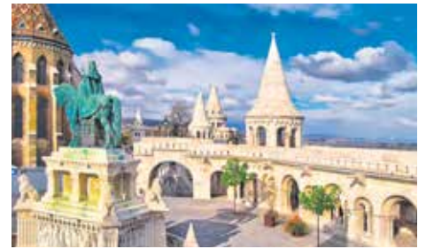
Matthias Church and Fisherman's Bastion, Budapest