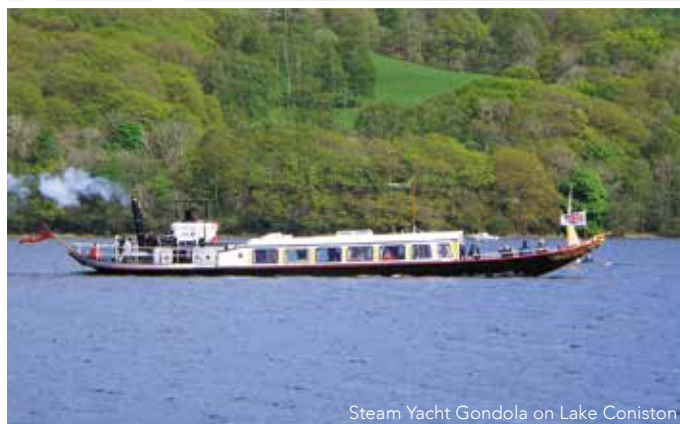
Steam Yacht Gondola on Lake Coniston