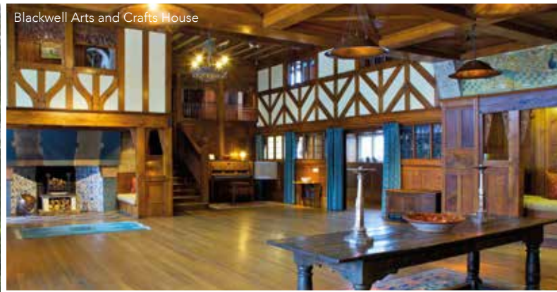
Blackwell Arts and Crafts House