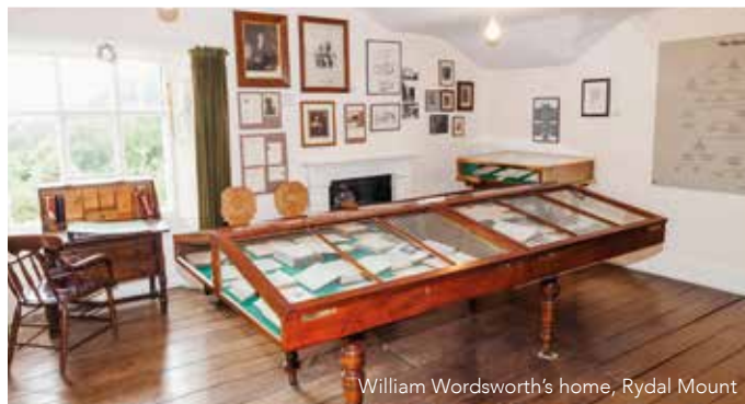
William Wordsworth's home, Rydal Mount