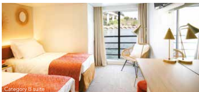
Category B suite

For our cruises along the Douro we have chartered the elegant MS Amalia Rodrigues. Launched in 2019, the ship has a warm, modern feel and offers a tranquil atmosphere on which to relax and enjoy the picturesque panoramas of the region. The vessel can accommodate up to 132-passengers but we will be limiting numbers to just 110 for our charters in order to enhance our guests' experience. The bright and airy cabins are located over three decks and many feature balconies with large picture windows. Public areas include the Restaurant, the Lounge Bar with floor-to-ceiling windows, and the Sun Deck with comfortable loungers and some tables and chairs under a shaded area. There is ample opportunity to watch the world gently pass by as you relax on board your comfortable floating hotel.