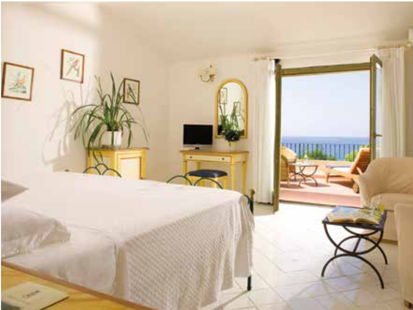
Superior Room with Sea View and Terrace