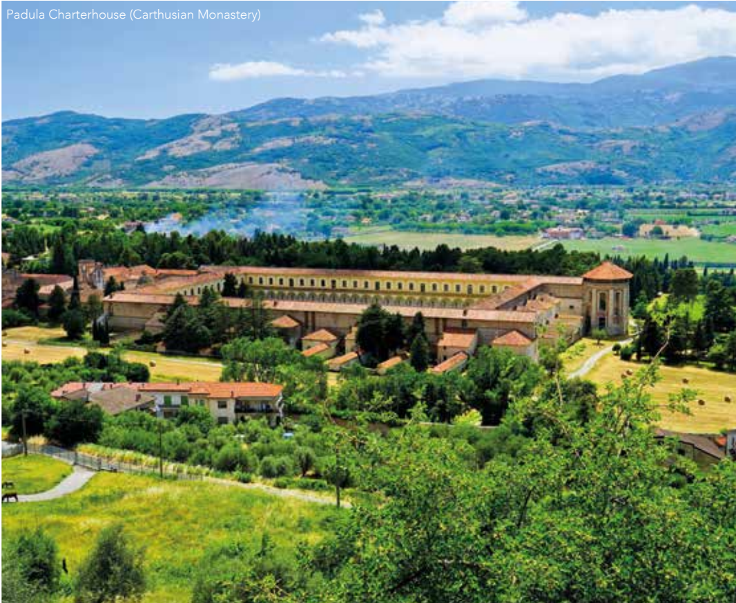
Padula Charterhouse (Carthusian Monastery)