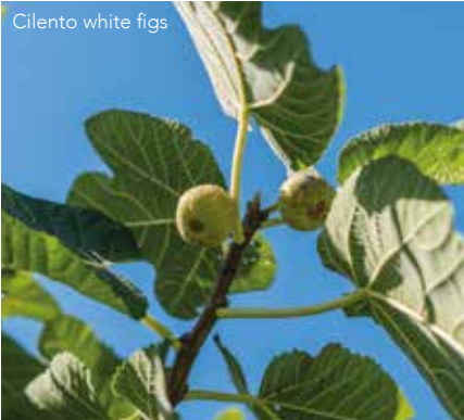
Cilento white figs