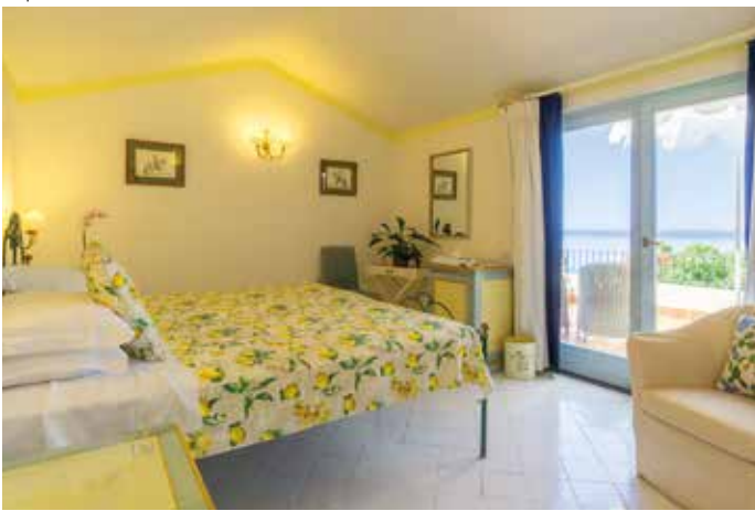
Standard Room with Seaview