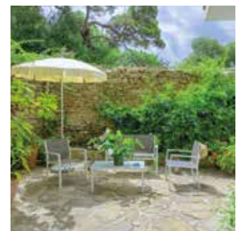
Luxury Suite, Patio