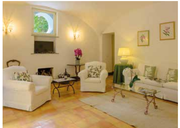
Luxury Suite Lounge

A path through the five acres of the Palazzo's gardens leads to the 25-metre fresh-water pool surrounded by bougainvillea, and beyond to a small door which leads down to the Palazzo's private beach. The terraces and magnificent fresh-water swimming pool are set in a profusion of greenery with an inviting pool terrace bar offering light lunches and cocktails. The wonderful views at Palazzo Belmonte inspire some guests to paint or draw, while others prefer to read and relax in the shade of the pine trees in the garden or by the pool. The Palazzo's Terrace Lounge Bar is an intimate place with unparalleled views. The refined and cosy atmosphere, with views of the sea stretching to infinity, makes it a magical place to spend a memorable evening sipping a good glass of wine. During the cooler months, there is a cosy sitting room where you can relax, read, play cards or simply enjoy a cup of coffee.