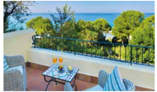
View from Superior Sea View Rooms