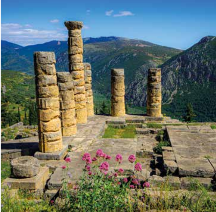
Temple of Apollo, Delphi