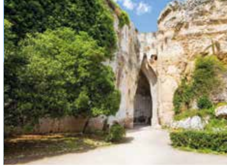
The 'Ear of Dionysius', Syracuse