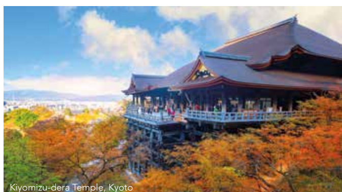
Kiyomizu-dera Temple, Kyoto

Day 13 Jigokudani & Obuse. After breakfast we will travel by coach to Jigokudani Snow Monkey Park. After an uphill walk through the snow covered forest we will arrive at the hot springs where we hope to see these famous Japanese macaques taking a bath. The monkeys live in large social groups and its likely you will encounter them along the path to the hot springs though being accustomed to humans they almost completely ignore visitors preferring to lounge in the pool or play with each other. Heading