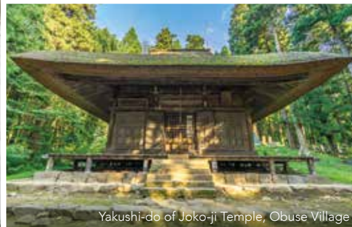
Yakushi-do of Joko-ji Temple, Obuse Village

beautiful gardens with walking paths. On the way to Nonomiya Shrine the path will lead us through the famous Arashiyama bamboo groves which are unlike any other in Japan. Nonomiya Shrine is a Shinto shrine where in ancient times, unmarried imperial princesses would stay for a year or more to purify themselves and is referenced in numerous works of literature, most notably in the world's first novel: the Tale of Genji. After lunch we will visit Nijo Castle, which was built by the founder of the Tokugawa Shogunate as the Kyoto residence of the Shogun and is surrounded by stunning gardens. The ornamental building was completed in 1603 and is well known for its Monoyama architecture, decorated sliding doors and 'chirping' nightingale floors. This evening will be at leisure. (B, L)