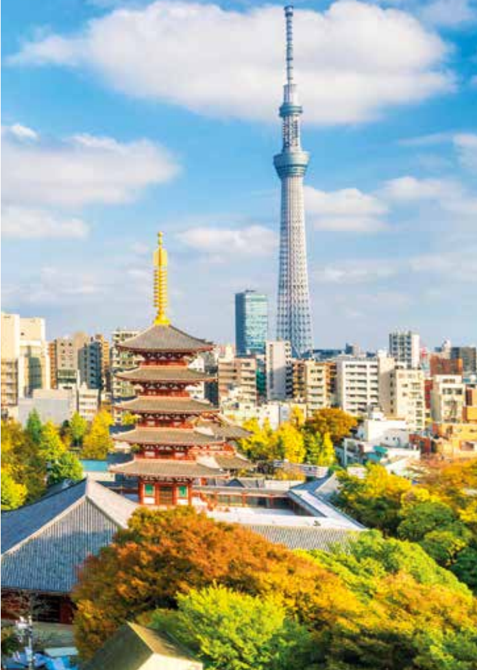
Sensoji Temple, Tokyo