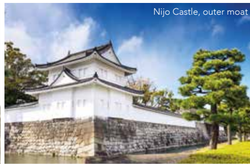
Nijo Castle, outer moat