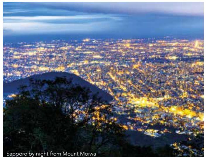
Sapporo by night from Mount Moiwa

Day 6 Kushiro to Sapporo. After breakfast we will depart Kushiro by train for Sapporo, the capital of Hokkaido. The journey will take us along the coast before turning inland to views of snow-covered mountains and fields. While on the train enjoy a Japanese bento box for lunch. On arrival in Sapporo we transfer to the hotel, our base for the next four nights. Every winter Sapporo is home to the Sapporo Snow Festival which started in 1950 when high school students built snow sculptures in Odori Park. Since then it has grown and developed into a major event attracting over two million visitors from around the world. With our local guides we will explore the snow festival taking in the large snow and ice sculptures, some are incredibly intricate and some have even reached over 25 metres wide and 15 metres high. After exploring the festival we will continue to dinner. (B, L, D)