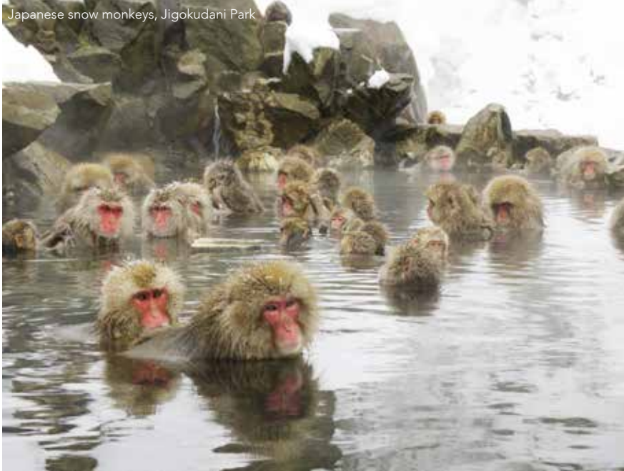
Japanese snow monkeys, Jigokudani Park