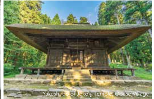
Yakushi-do of Joko-ji Temple, Obuse Village

path will lead us through the famous Arashiyama bamboo groves which are unlike any other in Japan. Nonomiya Shrine is a Shinto shrine where in ancient times, unmarried imperial princesses would stay for a year or more to purify themselves and is referenced in numerous works of literature, most notably in the world's first novel: the Tale of Genji. After lunch we will visit Nijo Castle, which was built by the founder of the Tokugawa Shogunate as the Kyoto residence of the Shogun and is surrounded by stunning gardens. The ornamental building was completed in 1603 and is well known for its Monoyama architecture, decorated sliding doors and 'chirping' nightingale floors. This evening will be at leisure. (B, L)