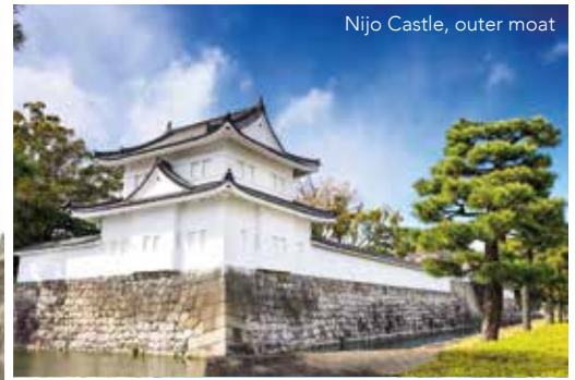
Nijo Castle, outer moat