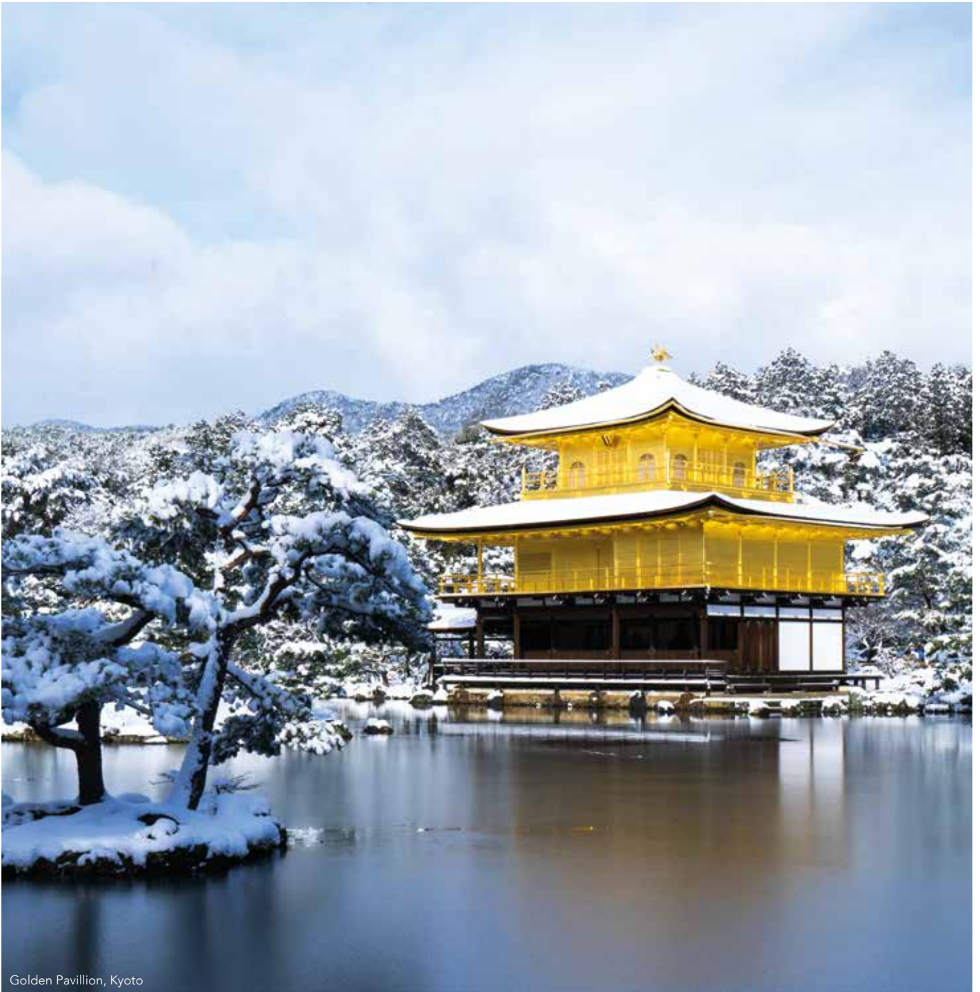
Golden Pavillion, Kyoto