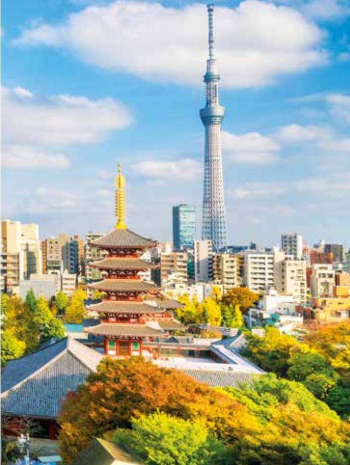
Sensoji Temple, Tokyo