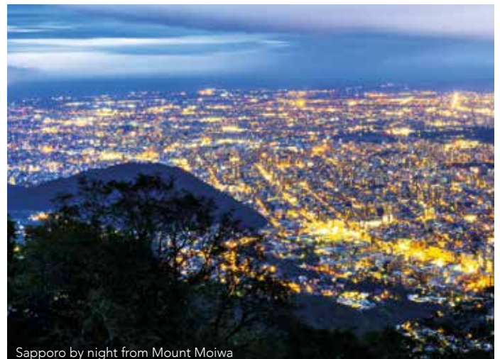
Sapporo by night from Mount Moiwa

Day 7 Sapporo. Today we will set out to explore the vibrant city of Sapporo. It is the largest city north of Tokyo and is surrounded by nature, with a