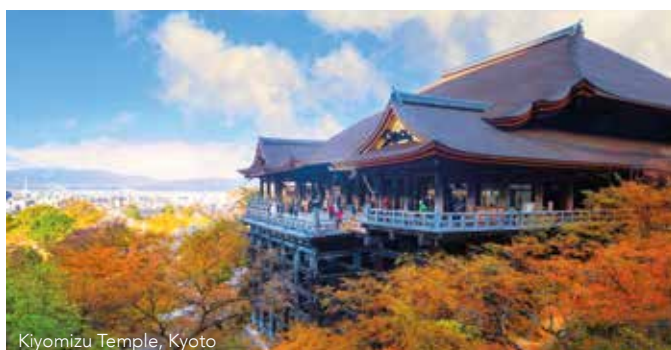
Kiyomizu Temple, Kyoto

Day 13 Jigokudani & Obuse. After breakfast we will travel by coach to Jigokudani Snow Monkey Park. After an uphill walk through the snow covered forest we will arrive at the hot springs where we hope to see these famous Japanese macaques taking a bath. The monkeys live in large social groups and its likely you will encounter them along the path to the hot springs though being accustomed to humans they almost completely