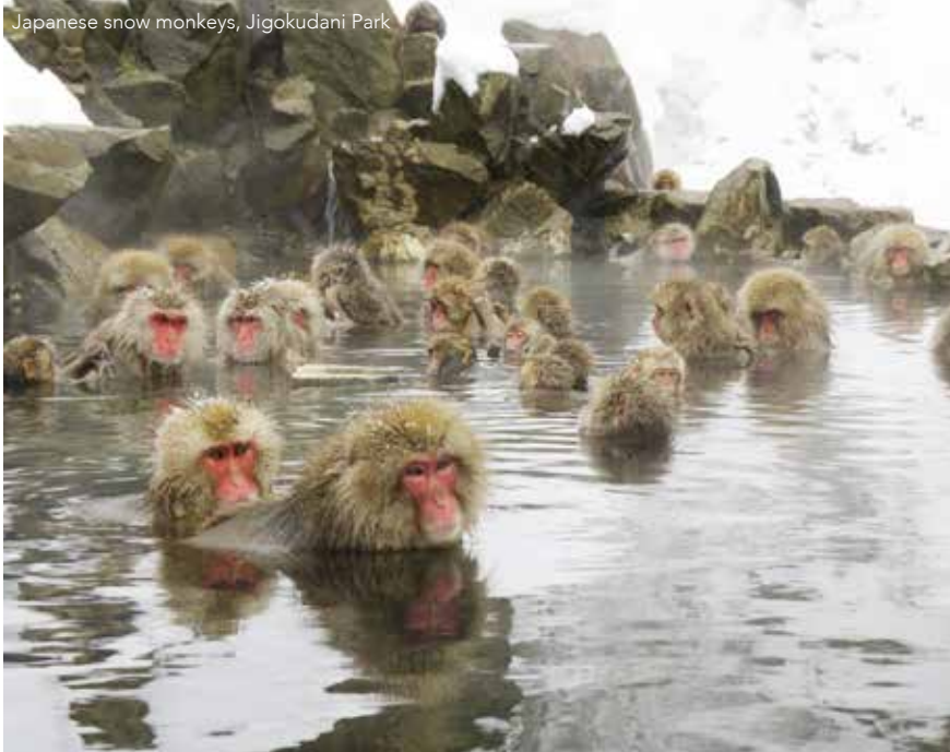
Japanese snow monkeys, Jigokudani Park