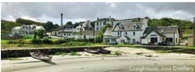
Craighouse, Jura Distillery

Day 2 Gigha & Jura, Inner Hebrides. Gigha is a place apart; heather covered hills, deserted beaches and a single lane verged with wildflowers that meander for some six miles between cottages and farms. Privately owned by its 120 inhabitants, it is a gem of a place and somewhere not easily forgotten. After landing by Zodiac, we will walk to the gardens of Achamore House where the Horlick family have created a lovely and eclectic garden with their collection of azaleas, rhododendrons and exotic plants. This afternoon we will use our Zodiacs to land on Jura. We will go ashore at Craighouse and will be welcomed in the cooperage