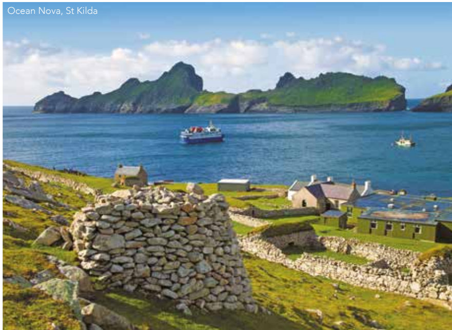
Ocean Nova, St Kilda

Scotland's magnificent coastline is an indented landscape of enormous natural splendour with offshore islands forming stepping stones into the Atlantic and this voyage will appeal to those who want to explore the wonderful scenery and the abundant bird and wildlife. If you have always had a hankering to visit some of the remotest and most inaccessible islands in Scotland, this is the ideal opportunity. Few cruise ships offer the chance to explore in-depth the islands off the northern coast of Scotland and this unique itinerary ventures far north to the Shetland and Orkney Islands as well as the magical Hebridean islands. Join us aboard the 84-passenger Ocean Nova as we sail from the port of Oban to the islands on the edge, visiting both inhabited and uninhabited islands and places of great natural beauty, rich in wildlife and many with a long history dating back to the Iron Age.