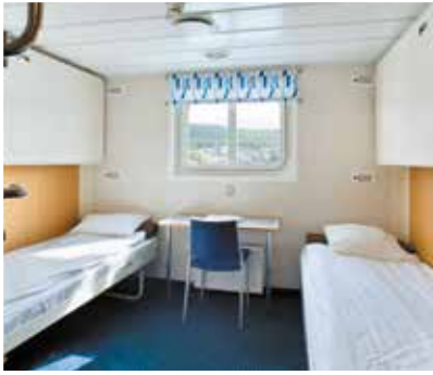
Category 3 Cabin