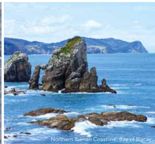
Northern Iberian Coastline, Bay of Biscay