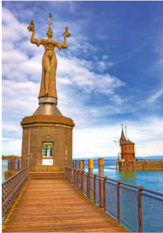
Imperia statue, Konstanz