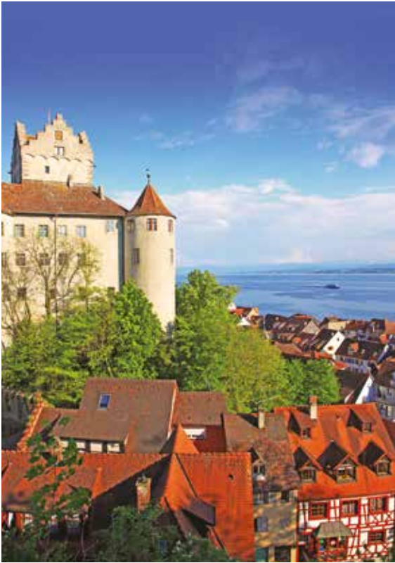
Medieval Meersburg Castle overlooking Lake Constance