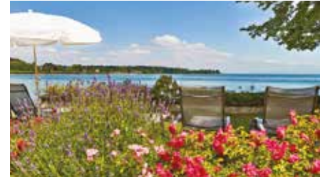
Relax with breathtaking views of Lake Constance