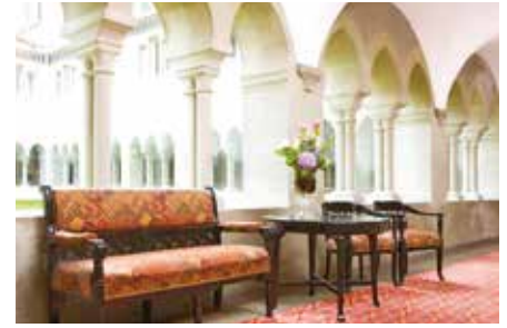
Cloisters of the old monastery

The hotel benefits from a well-equipped gym, a Finnish sauna and steam room, and special treatments and massages can also be booked onsite. In addition, there are lakeside trails around Lake Constance which are perfect for a relaxing walk or bike ride.