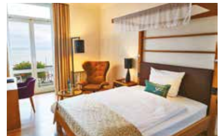
Lake View Single Room