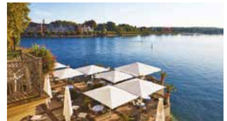
The Lakeside Terrace