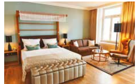
Lake View Double Room