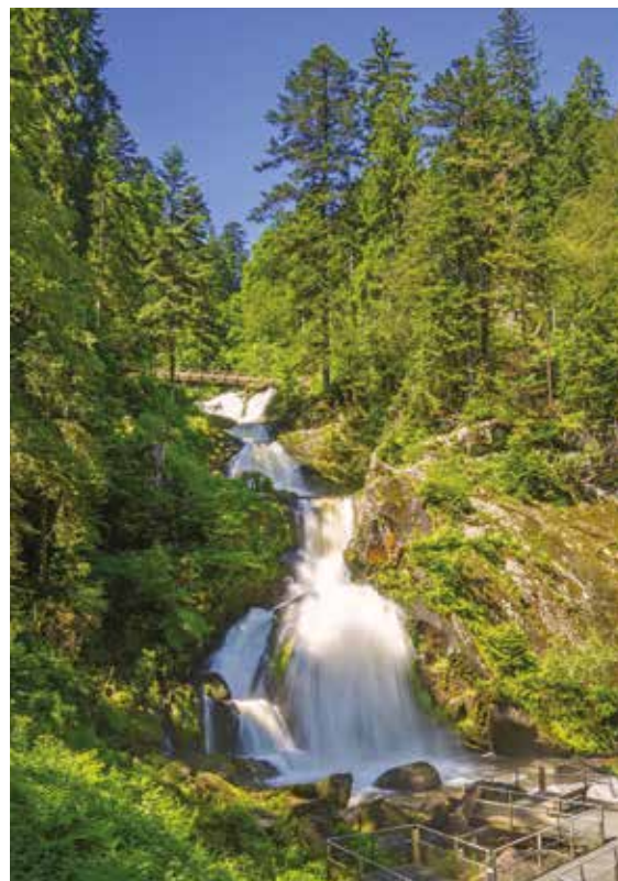
Triberg Waterfalls in the Black Forest

famous Minster with its magnificent neo-Gothic architecture before ending at Imperia, a 30 feet high statue inspired by a 16th century Italian courtesan of the same name. It bears in each hand the symbol of earthly and divine power, a reference to the many church dignitaries who attended the Council of Konstanz in the 15th century. While highly controversial on its conception in 1933, it is now regarded as the symbol of Konstanz. (B)