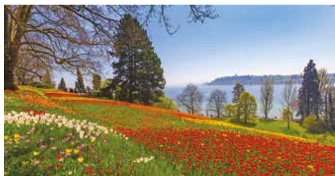
Flower Island of Mainau

Day 7 Zurich, Switzerland to London. After breakfast bid farewell to Lake Constance and transfer to Zurich airport for the return scheduled flight to London. (B)