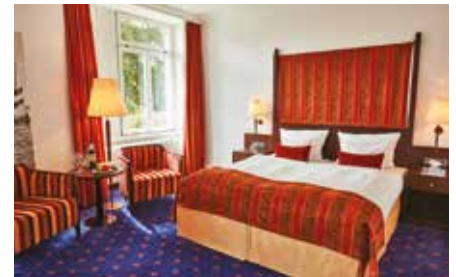
Garden View Double Room