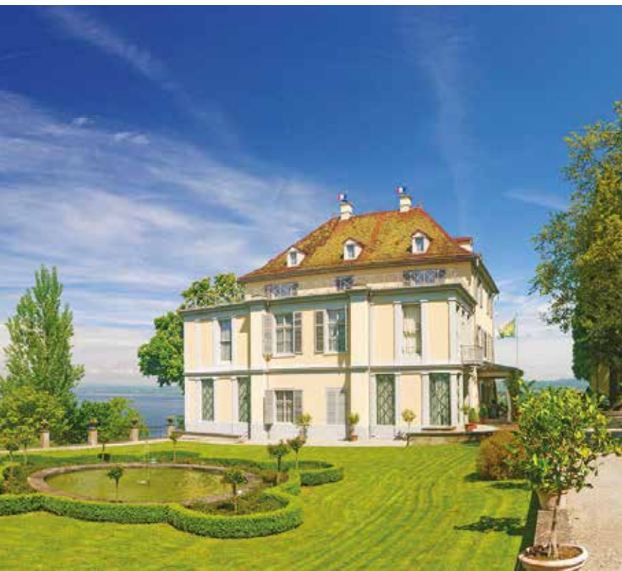
Arenenberg Castle and Gardens