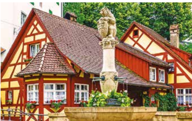
Medieval village of Meersburg

The Steigenberger Insel Hotel is scenically positioned on the shores of the lake and when you can stir yourself from this idyllic setting there is a wealth of wonderful things to see and do and we have devised an itinerary which includes a perfect combination of included tours and ample time at leisure. If you enjoy gentle walking, there is nothing better than a lakeside walk amidst much surrounding beauty as the region benefits from a mild climate with exotic plants and flowers on display.