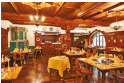
Dominikaner Stube Restaurant

The hotel has two restaurants. The Seerestaurant offers a lavish buffet breakfast as well as lunch and dinner featuring international cuisine and fish dishes prepared from the morning's catch. It provides an elegant, historic atmosphere and gives onto the hotel terrace which is a magnificent spot from which to enjoy a sundowner and take in the lake views.