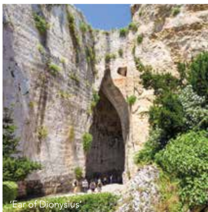
'Ear of Dionysius'