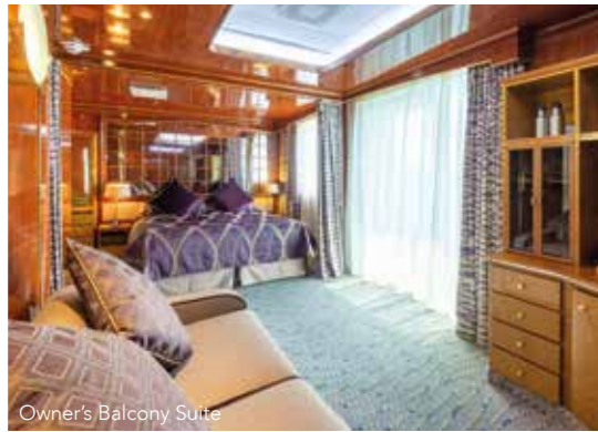
Owner's Balcony Suite