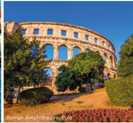
Roman Amphitheatre, Pula

During this unique voyage aboard the 118-passenger MS Hebridean Sky we will sail from Venice to Valletta visiting Slovenia, Croatia, Montenegro, Albania and Italy, cruising through turquoise waters, admiring the spectacular landscapes and visiting some of the region's greatest sites along the way. Regular travellers to this part of the world will know that autumn is one of the loveliest times of year in the region with crowd-free sites and ideal weather for touring.