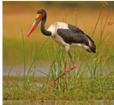
Saddle-billed Stork in the Okavango Delta

Days 6 & 7 Xugana Lagoon. Situated in the north-western corner of Botswana, the Okavango Delta is a World Heritage Site as it is the largest inland delta in the world. The magnificent Okavango River sprawls out over the dry sands of the Kalahari Desert forming this flourishing waterlogged oasis featuring countless meandering waterways and crystal clear lagoons studded with water lilies, as well as fertile floodplains and reeded islands inhabited with abundant wildlife. The Okavango Delta stretches over