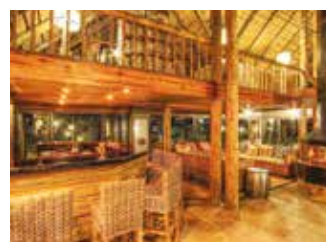
Lounge and Bar

Located on the banks of the Savute Channel, Savute Safari Lodge is intimate with just 11 thatched chalets built of local timber. The chalets, which have been elegantly furnished in calm neutral tones to blend with the natural environment, feature expansive private decks, a combined bedroom and lounge area and en-suite facilities. Sink into one of the numerous comfortable sofas in the lounge and library or sip a cocktail in the stylish bar. All these facilities are situated in a beautiful two storey thatch and timber main building. Savute Safari Lodge offers a shaded viewing deck, an al fresco dining area and swimming pool with spectacular pool loungers –ideal for watching the varied wildlife, including the resident elephants, as they make their way to the channel to drink, bathe and play. Twice daily activities are organised around game drives throughout the