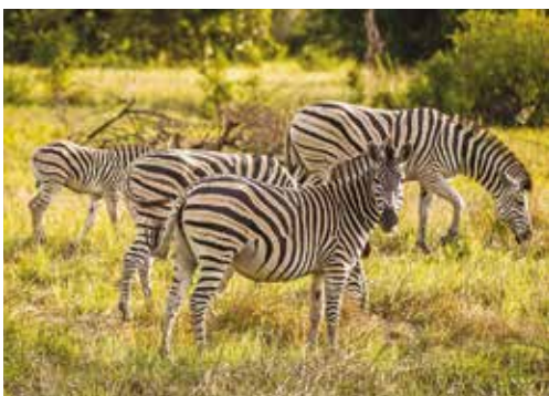
Zebra, Moremi Game Reserve

Days 9 & 10 Savute. Savute lies in the heart of Botswana's beautiful Chobe National Park. This dynamic wilderness is a sweeping expanse of savannah brooded over by several rocky outcrops which guard a relic marsh and the dry channel that was once its lifeline. The Savute goes through wet and dry cycles, where wild dogs hunt in the dry river channel where crocodiles swam only twenty years ago. Visitors to this spectacular area can spot abundant wildlife including a variety of birds, elephants, antelope, lion prides, black-backed jackal, bat-eared foxes, tsessebe, kudu, hyena, cheetah Cape buffalo herds, and thousands of migrating zebra and wildebeest. (B, L, D)