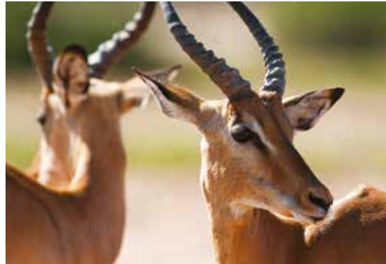
Impala, Chobe National Park