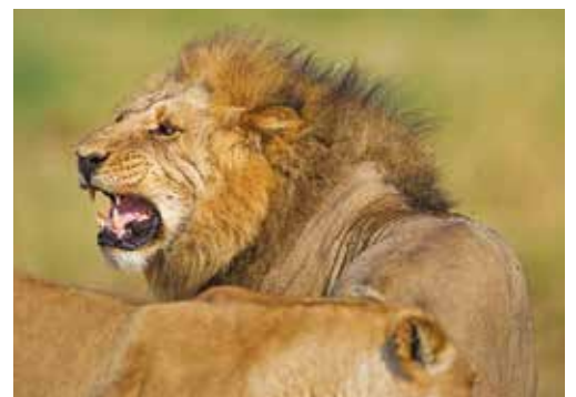
Male and Female Lions, Moremi Game Reserve