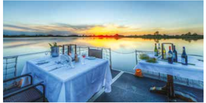
Outdoor Dining on the Lodge Barge

Peeking out from under a lush green woodland canopy, Camp Moremi, in the Xakanaxa area of Moremi Game Reserve, is a truly hidden gem. At the point where the life-giving waters of the Okavango Delta meet the vast plains of the Kalahari Desert, Mother Nature has created a sanctuary of Mopane forests, open grasslands, seasonal floodplains and riverine habitats, resulting in one of the most magnificent and welcoming animal environments in all of Africa. Shaded from the African sun by a forest of ancient ebony trees, Camp Moremi is an elegant thatch and timber lodge consisting of an elevated main lounge, wildlife reference library, dining room and cocktail bar. Facilities at Camp Moremi include a secluded swimming pool and sundeck, an elevated viewing platform with a breathtaking panorama of Xakanaxa Lagoon, and a thatched boma where brunch or afternoon tea can be enjoyed. For an authentic and personal safari experience, Camp Moremi accommodates just 22 guests in East African-style individual safari tents, each situated on a raised teak platform with private adjacent facilities and viewing deck. A complimentary laundry service is also offered.