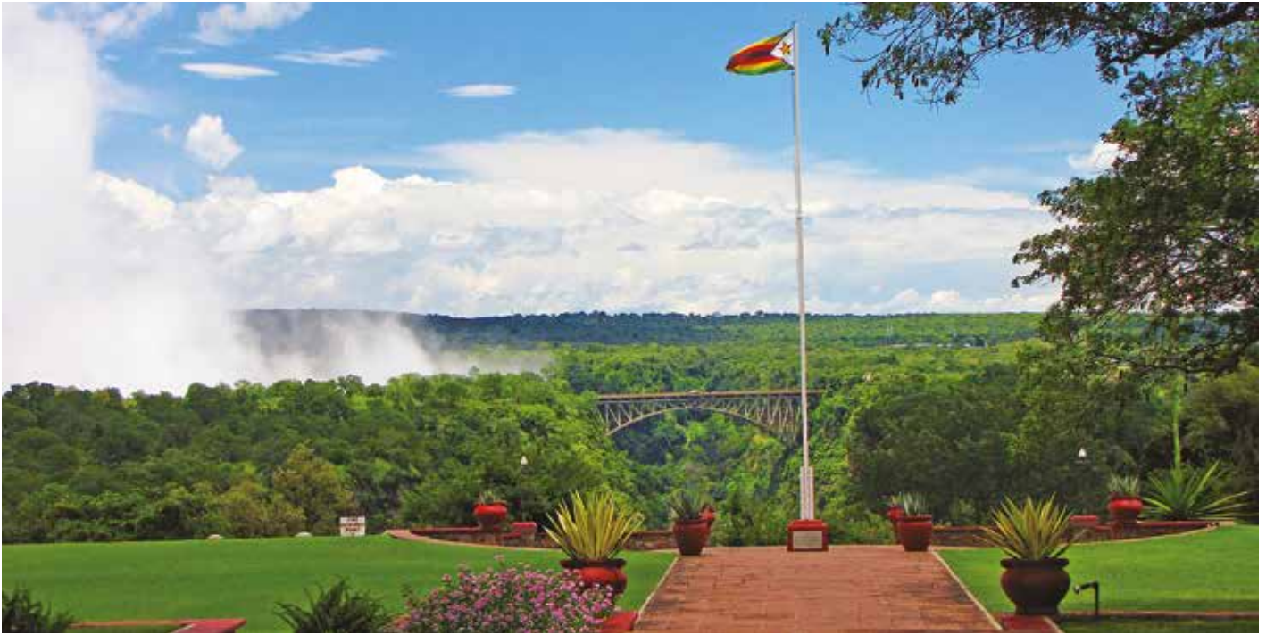
View of Victoria Falls Bridge from the hotel grounds