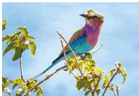
Lilac Breasted Roller in Chobe National Park

Day 11 Victoria Falls, Zimbabwe. The final stop on our wonderful journey is the stunning Victoria Falls. We fly to Kasane Airport and transfer by road to the luxurious Victoria Falls Hotel for our two night stay. (B, D)