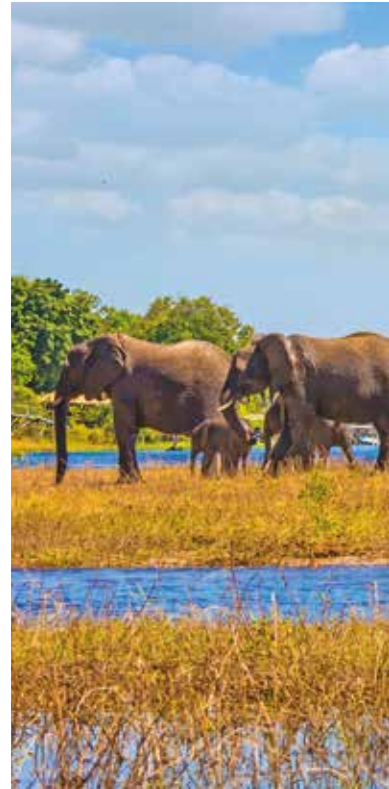
Elephant herd, Chobe National Park