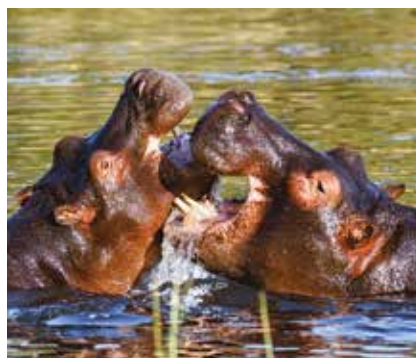
Hippos in the Okavango Delta