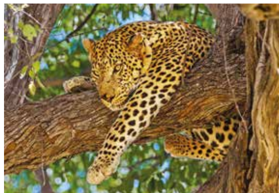
Leopard, Moremi Game Reserve