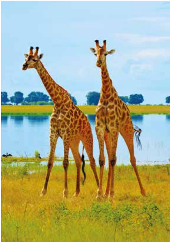
Giraffe, Chobe National Park