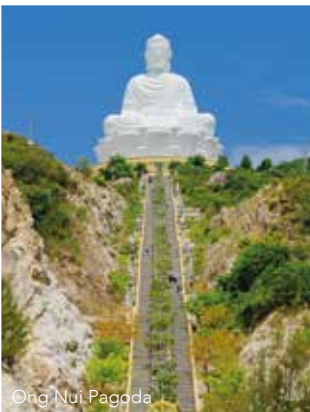
Ong Nui Pagoda