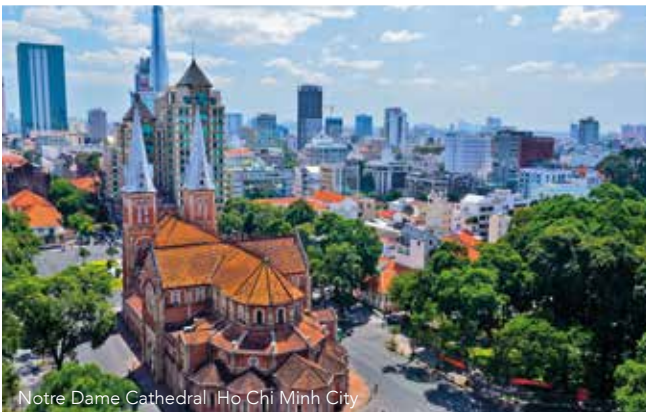
Notre Dame Cathedral, Ho Chi Minh City