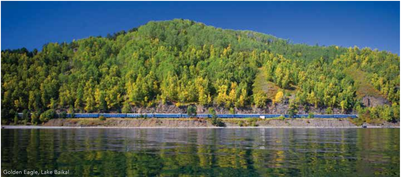
Golden Eagle, Lake Baikal