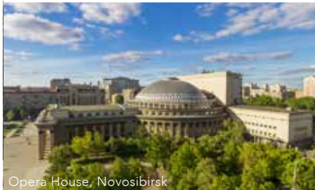
Opera House, Novosibirsk