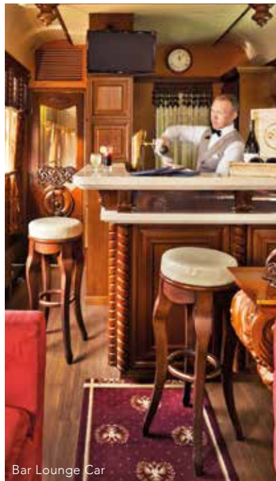
Bar Lounge Car

Throughout the journey, you can expect a service which is attentive, friendly and unintrusive. Your car attendants provide 24-hour housekeeping and bedding turndown services and the Train Tour Manager is there to co-ordinate all of the elements and to assist you as required. There is a Wi-Fi service on board though coverage is limited and will usually only be available as we pass through larger cities and towns. However, the aim is to provide internet access in a local hotel or restaurant for guests at least every other day.