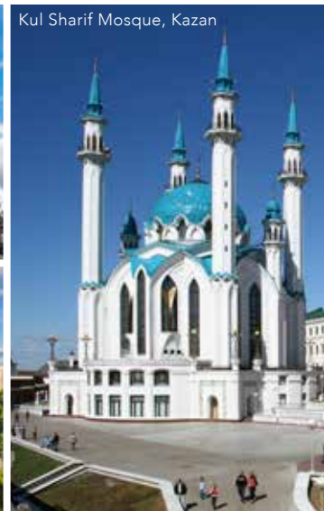
Kul Sharif Mosque, Kazan