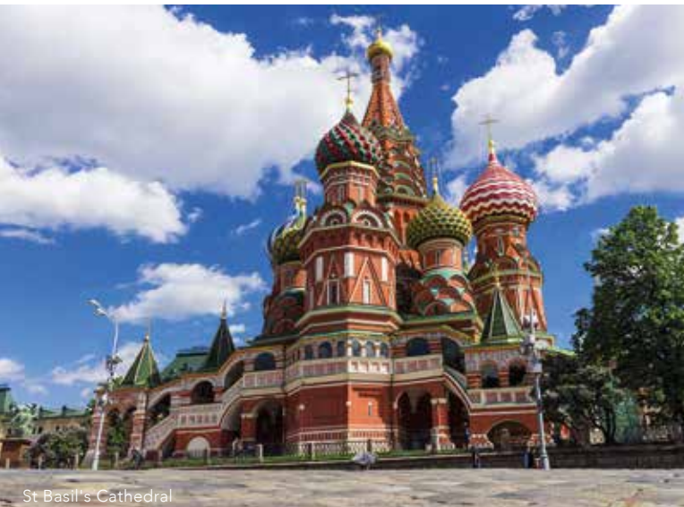
St Basil's Cathedral