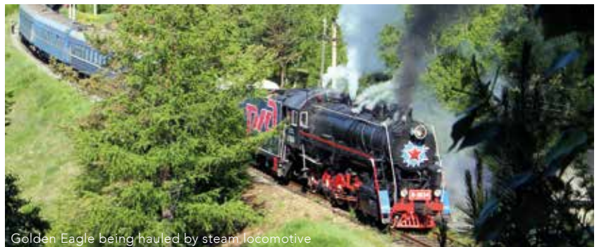
Golden Eagle being hauled by steam locomotive