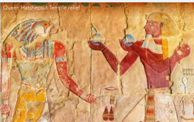
Queen Hatshepsut Temple relief