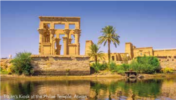
Trajan's Kiosk at the Philae Temple, Aswan