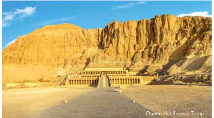
Queen Hatshepsut Temple