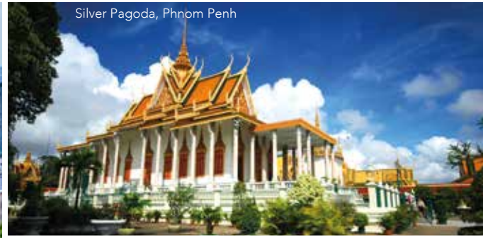
Silver Pagoda, Phnom Penh