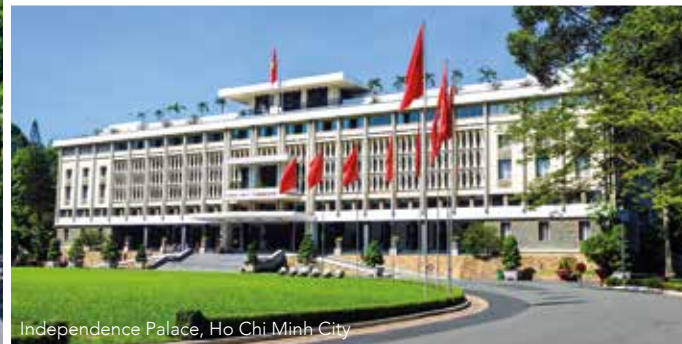
Independence Palace, Ho Chi Minh City