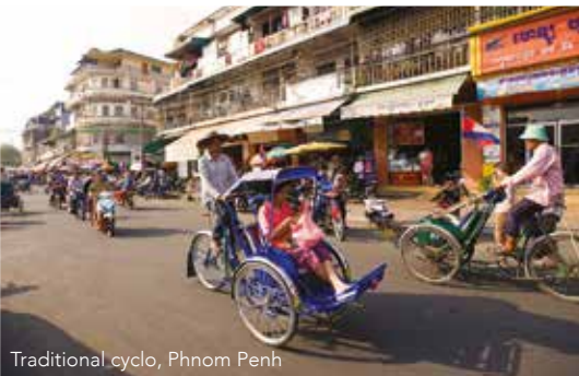
Traditional cyclo, Phnom Penh