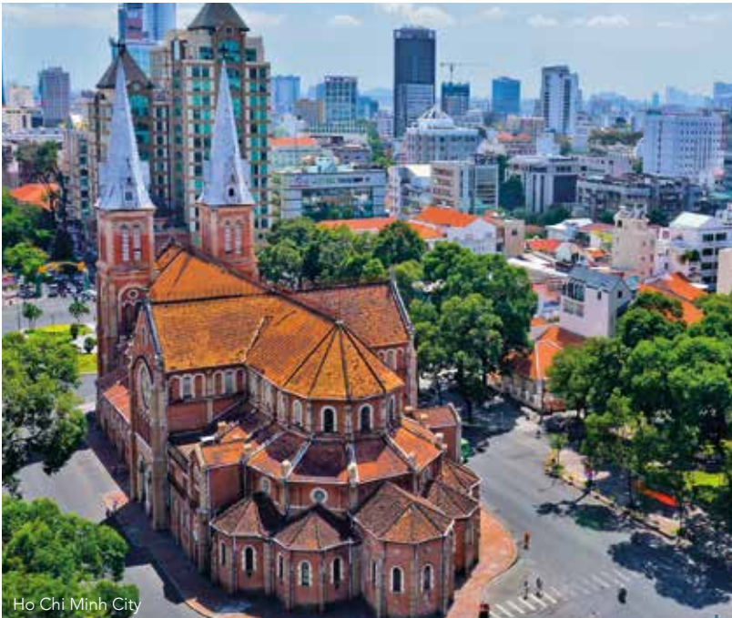
Ho Chi Minh City