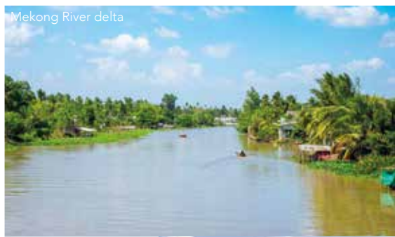
Mekong River delta