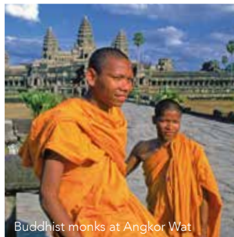
Buddhist monks at Angkor Wat

time we return to the cyclos for a ride to the National Museum which houses the largest pre-Angkorian and Angkorian holdings in Cambodia. (B, L, D)