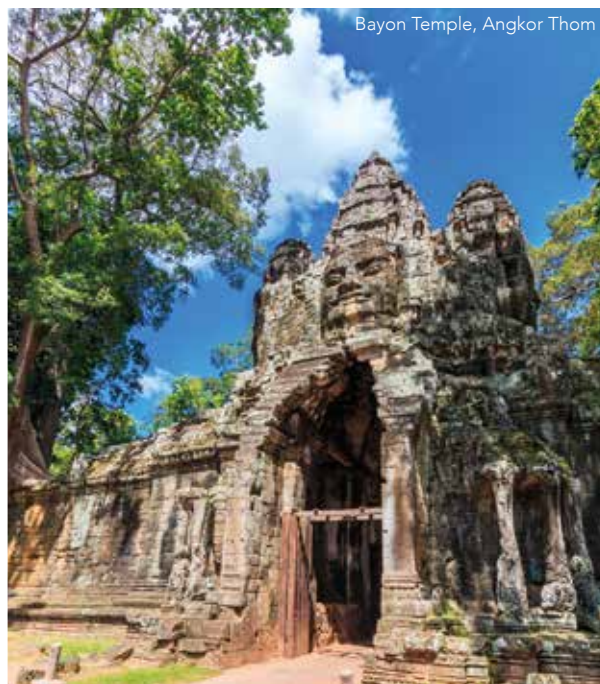
Bayon Temple, Angkor Thom