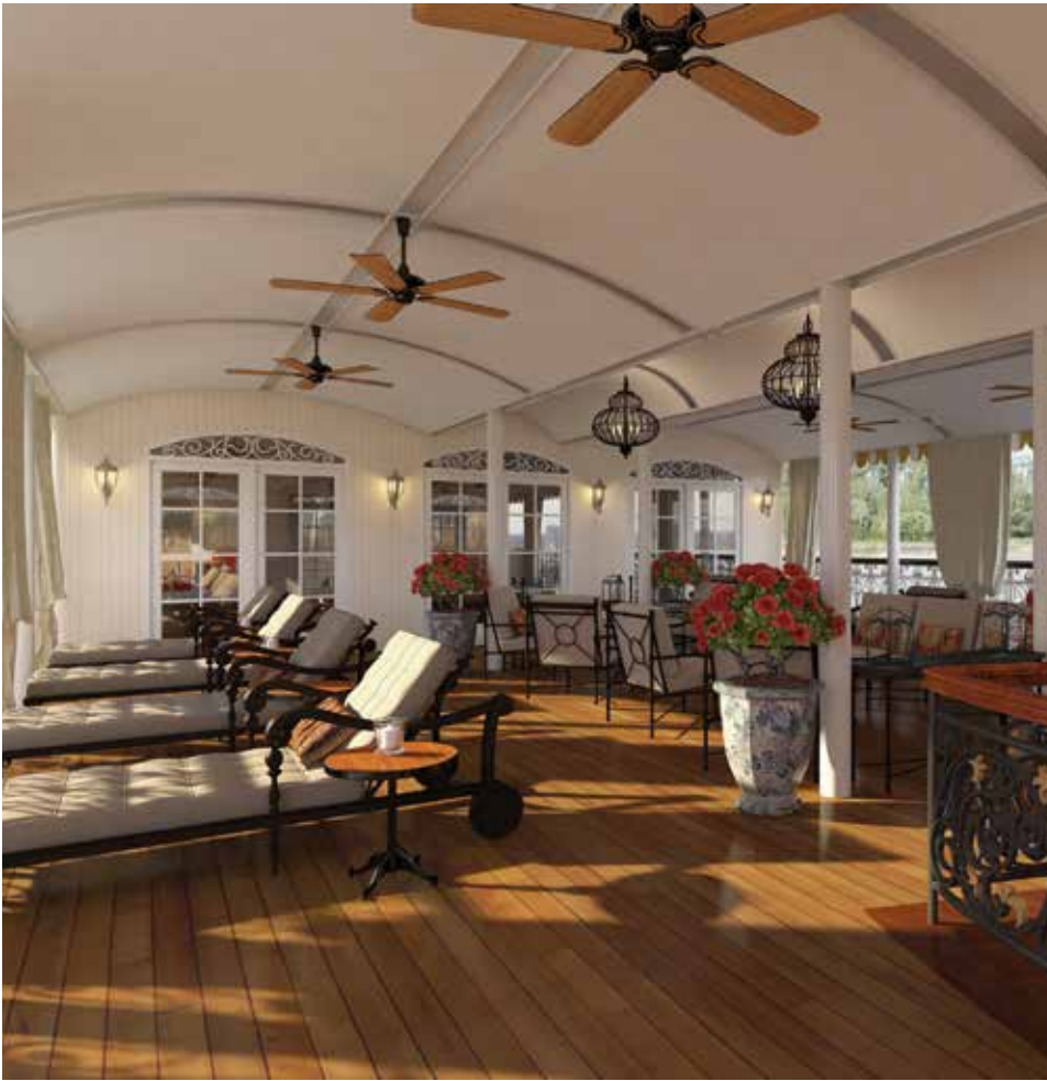
Outdoor Observation Area