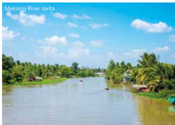
Mekong River delta