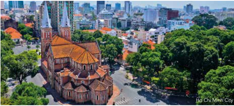
Ho Chi Minh City