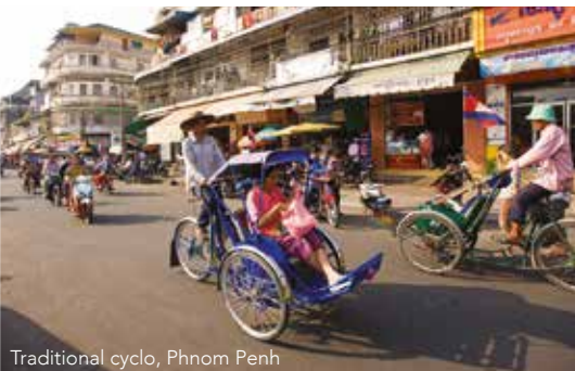
Traditional cyclo, Phnom Penh