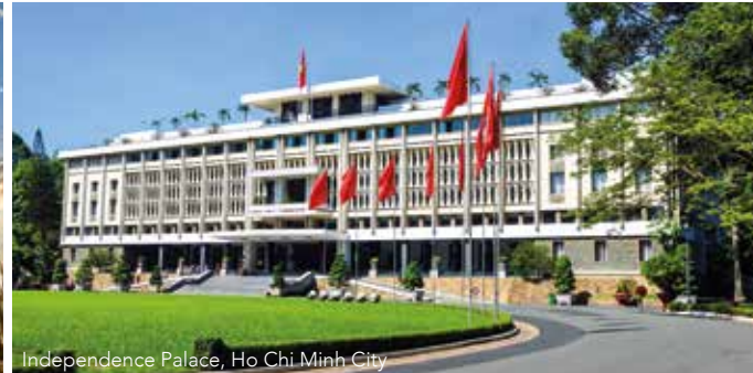
Independence Palace, Ho Chi Minh City