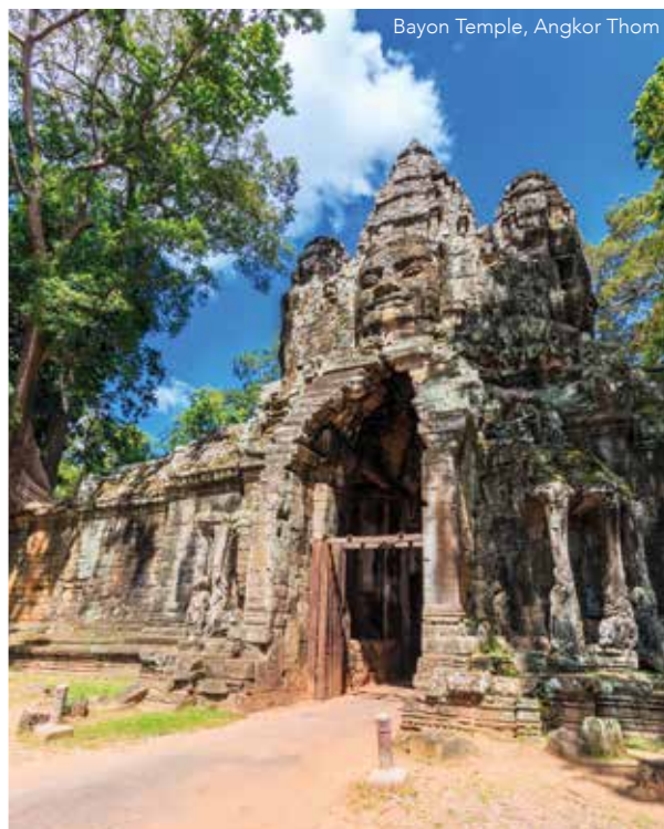
Bayon Temple, Angkor Thom