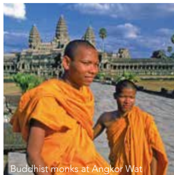
Buddhist monks at Angkor Wat

Day 8 Phnom Penh, Cambodia. This morning the RV Mekong Princess sails towards Phnom Penh. After lunch on board join local cyclo drivers for an afternoon city tour of Phnom Penh. We ride along the riverfront to the Royal Palace, where we enjoy a leisurely walk through the grounds, with opportunities to visit the Throne Hall and Moonlight Pavilion. Upon crossing into the second section of the complex, we walk amongst enormous stupas and spirit houses. We continue to the famous silver pagoda, home of Cambodia's Emerald Buddha and Maitreya Buddha, encrusted with more than 9000 diamonds. Following some free time we return to the cyclos for a ride to the National Museum which houses the largest pre-Angkorian and Angkorian holdings in Cambodia. (B, L, D)