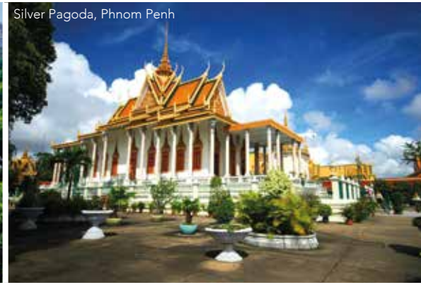
Silver Pagoda, Phnom Penh