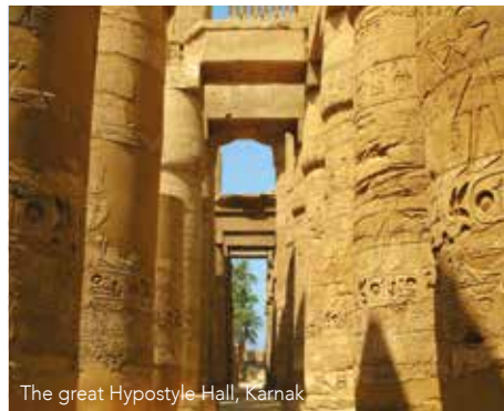
The great Hypostyle Hall, Karnak