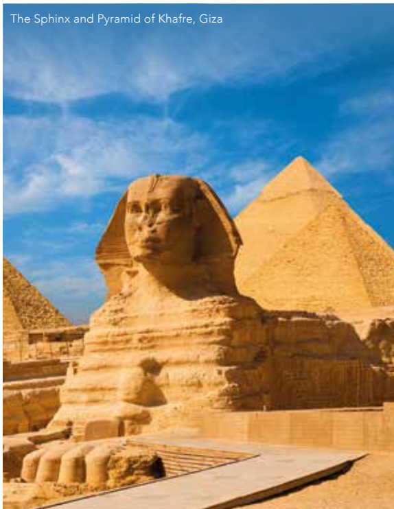
The Sphinx and Pyramid of Khafre, Giza