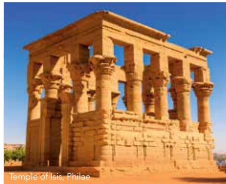
Temple of Isis, Philae