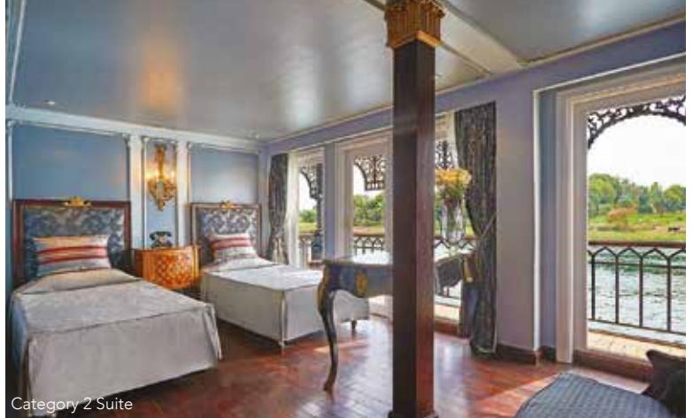
Category 2 Suite