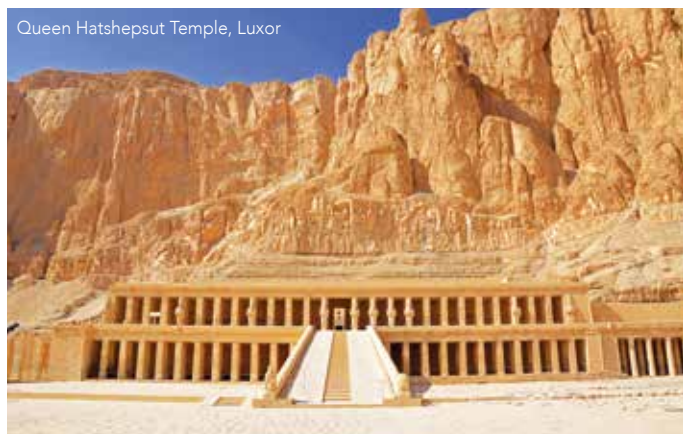
Queen Hatshepsut Temple, Luxor

Day 13 Cairo to London Heathrow. Disembark this morning and transfer to Cairo airport for your return scheduled flight to London Heathrow.