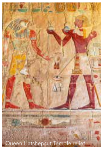
Queen Hatshepsut Temple relief