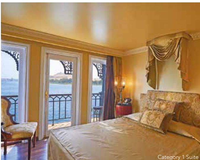
Category 1 Suite

For our journeys along the Nile, we are delighted to have chartered a very special and unique vessel, the SS Misr. Originally constructed in Preston by the Royal Navy in 1918, the SS Misr was purchased and later converted into a luxury Nile steamer for King Farouk. Now fully restored to a five-star deluxe propeller steam vessel she accommodates just 44 passengers in spacious, air-conditioned cabins and suites. Misr means 'the Kingdom of Egypt' and the décor throughout the vessel reflects the period.