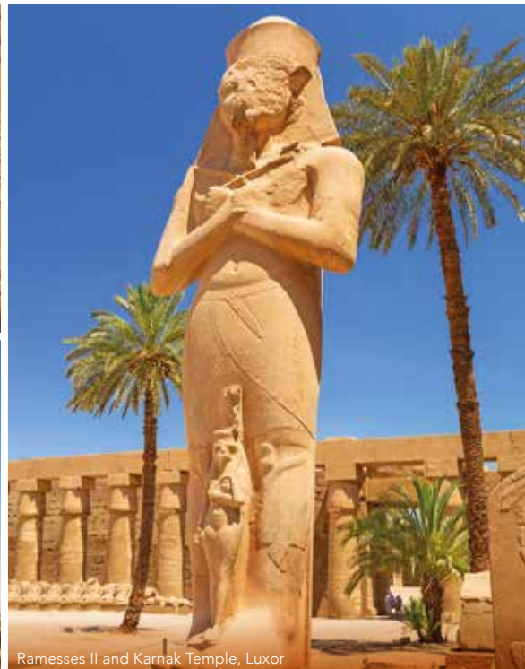
Rarnesses II and Karnak Temple, Luxor

Day 9 Tuna El Gebel, Ashmunein & Tel El Amarna. This morning we visit the tombs and catacombs of Tuna El Gebel, the necropolis of Khmun located in Al Minya and visit the Ashmunein open air museum. Afterwards we continue to Akhenaten's royal city, tomb and palace at Amarna; it is here we visit the tombs of Ahmose, Pentu, Meryrae and the Royal tomb of Akhenaten.