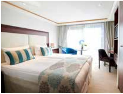
Cat A & B Cabin