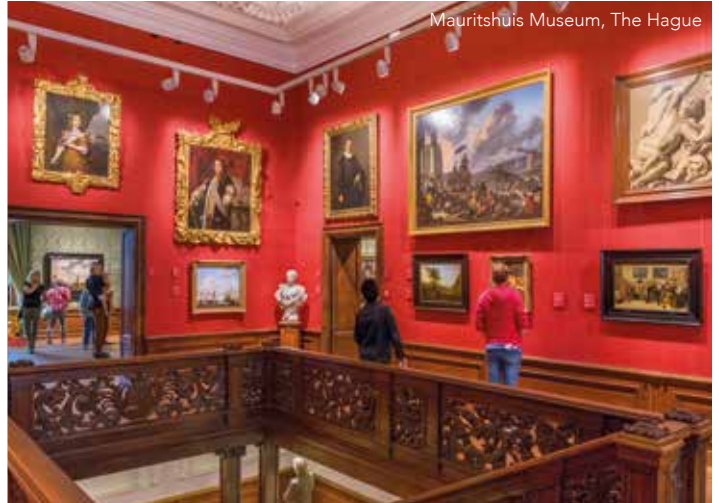
Mauritshuis Museum, The Hague