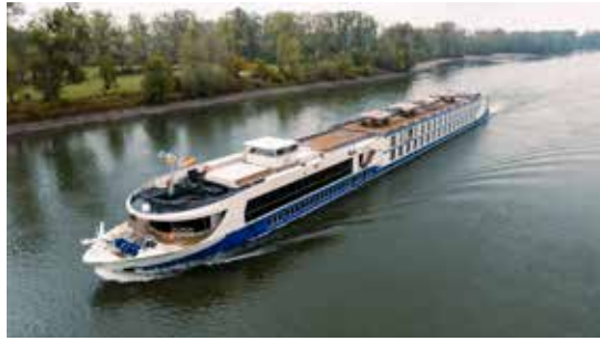
MS Charles Dickens