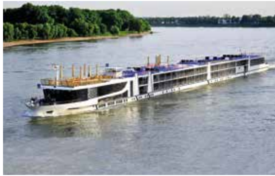
MS River Crown