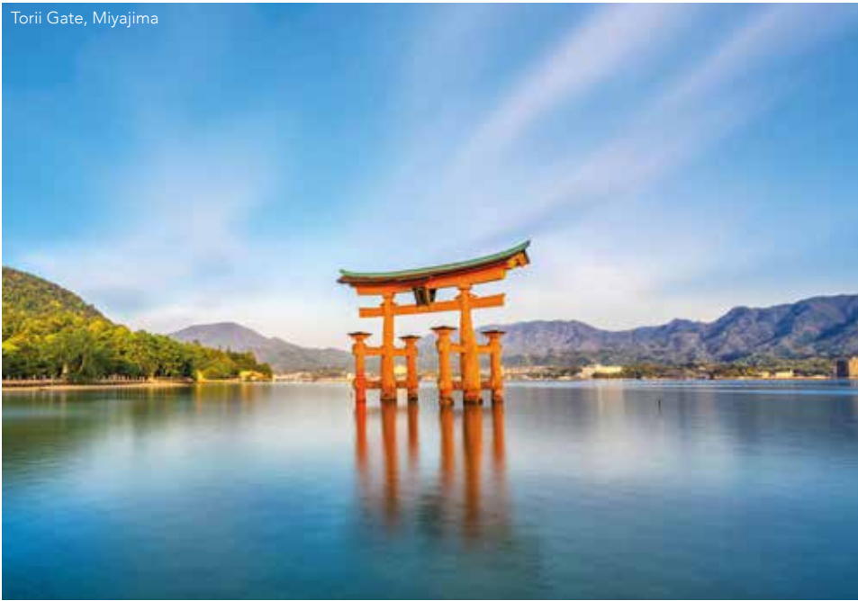
Torii Gate, Miyajima