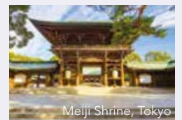
Meiji Shrine, Tokyo

If you would like to spend some additional time in Tokyo we have arranged a two night extension.