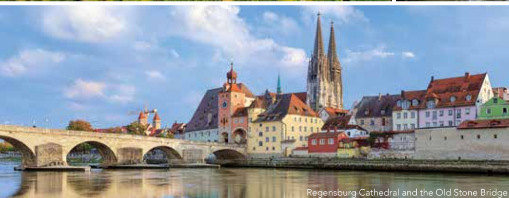
Regensburg Cathedral and the Old Stone Bridge