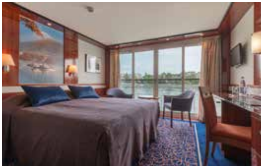
Premium Cabin with French Balcony (prior to refurbishment)