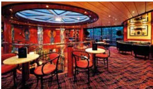
Atrium Lobby (prior to refurbishment)