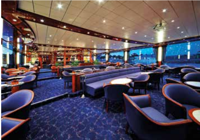
Lounge & Bar (prior to refurbishment)