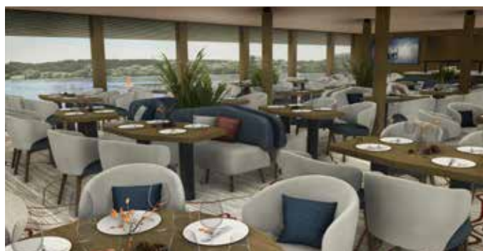
Illustration of Restaurant post-refurbishment

A well designed feature of the MS River Crown is the positioning of the Restaurant and the Lounge and Bar on the Upper Deck. These public areas have floor to ceiling windows, affording excellent views as you dine, relax or listen to the onboard lectures. There is also an Atrium Lobby with seating where you can access tea and coffee 24-hours a day, whilst the Club area on board comprises of two small lounges, a perfect place if you are seeking somewhere to relax with a good book and a tea or coffee. The huge Sun Deck covers almost the entire length of the vessel, interrupted only by the bridge and is the ideal location to watch the changing scenery. There is also a putting green and a large chess board on the Sun Deck for your enjoyment. For some time out, you can relax in the wellness centre which includes a sauna with shower facilities, and a fitness room.