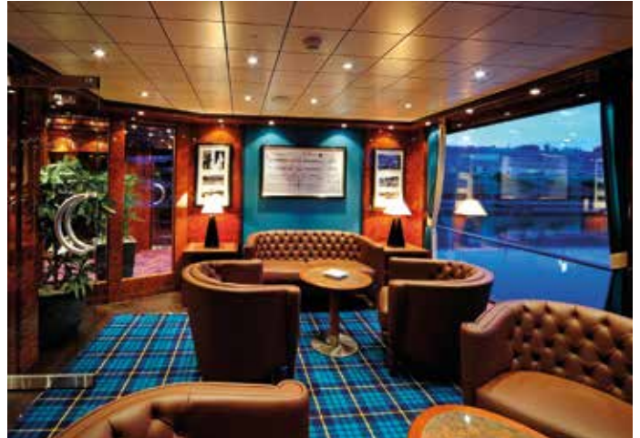
The Club (prior to refurbishment)