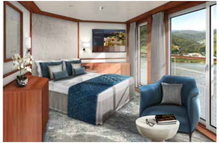
Illustration of Deluxe Cabin with French Balcony post-refurbishment