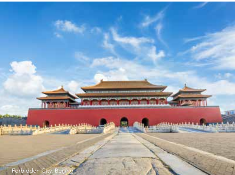
Forbidden City, Beijing