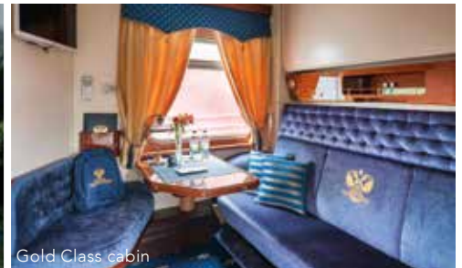
Gold Class cabin