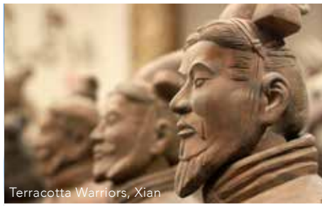
Terracotta Warriors, Xian