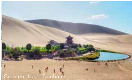
Crescent Lake, Dunhuang