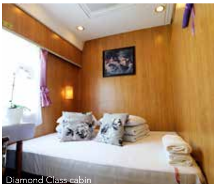
Diamond Class cabin