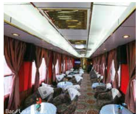
Bar / Lounge car