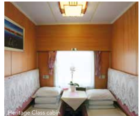
Heritage Class cabin