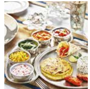
Food on board