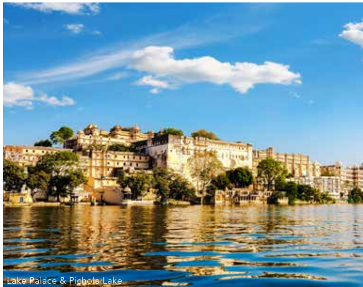
Lake Palace & Pichola Lake