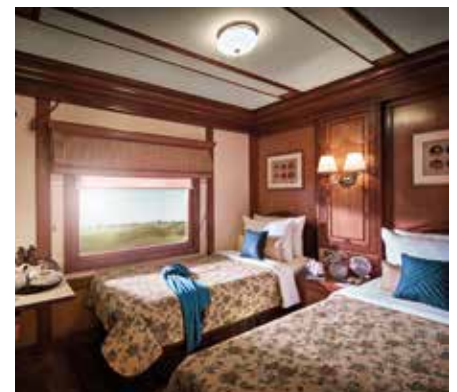
Deluxe Twin Cabin