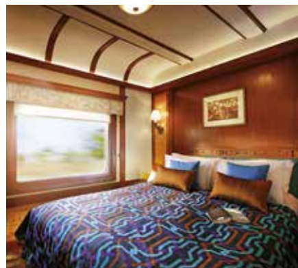
Deluxe Double Cabin