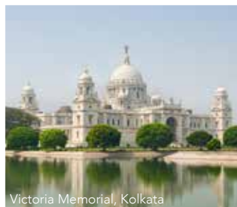
Victoria Memorial, Kolkata

or embark on the Darjeeling Himalayan Railway, itself listed as a UNESCO World Heritage Site, which takes about six hours from Tindharia. Also known as the 'Toy Train' it is a two feet (610 millimetre) narrow-gauge railway. Travelling through awe-inspiring scenery our locomotive zigzags and loops gaining height to reach the cooler air of India's most famous hill station. We climb to Ghum, which situated at 7407 feet (2,258 metres) is the highest railway station in India, where snow-covered Mount Kanchenchunga (third highest in the world) dominates the skyline, before dropping into Darjeeling itself, first crossing the graceful loop at Batasia. A packed lunch is served on board the train before our arrival into colonial Darjeeling. We will have dinner in the Hotel Mayfair (or similar), where we will stay for three nights. Perched on a picturesque hill with beautiful views of the valley, the Mayfair is a heritage hotel that exudes old-world charm and quiet elegance.