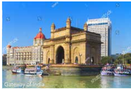
Gateway of India