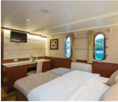
Category 4 cabin