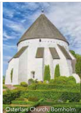
Osterlars Church, Bornholm

seat of the Estonian parliament. Walking to the lower Old Town we will visit the main square where we will find the oldest pharmacy in Europe, the Gothic Cathedral and the 15th century Town Hall. This afternoon we drive to the outskirts of Tallinn to Kadriorg Palace and Park, which were commissioned in 1718 by Russian Tsar Peter I, soon after his conquest of Estonia, in honour of his wife Catherine I. The palace was designed by Italian architect Nicola Michetti. Its magnificent main hall is considered one of the finest examples of Baroque architecture, not only in Estonia but also in Northern Europe. We will visit the art collection housed within the palace and spend time exploring the magnificent park with its fountains, hedges, and flowerbeds, modelled on Versailles. Before leaving we will enjoy a private classical concert.