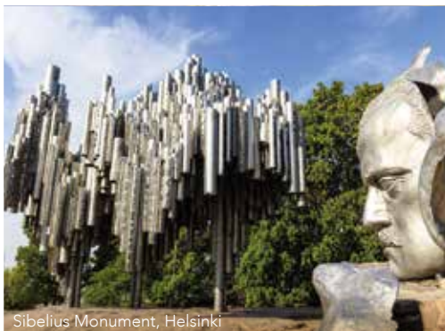
Sibelius Monument, Helsinki