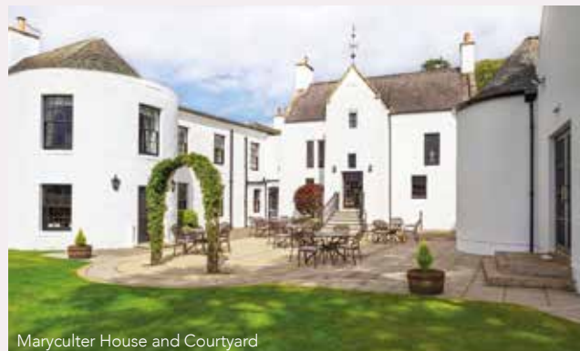
Maryculter House and Courtyard

Spend some time in Aberdeen before embarking on your cruise with a two night stay at one of Aberdeenshire's most historic hotels, nestled on the banks of the graceful River Dee.