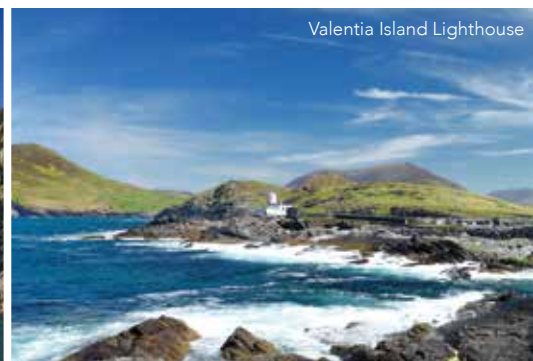
Valentia Island Lighthouse