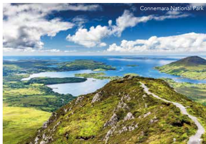
Connemara National Park

Day 5 Galway. From Galway we explore the beautiful region of Connemara. Here the National Park covers nearly 3,000 hectares of scenic mountains, heaths and woodland and is home to herds of ponies. During our drive along