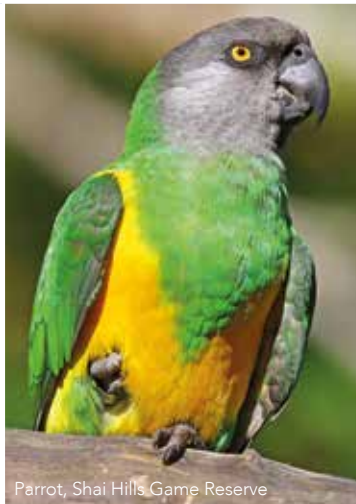
Parrot, Shai Hills Game Reserve