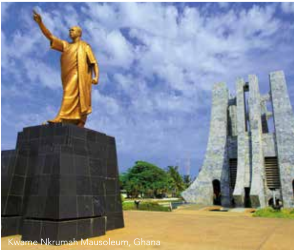
Kwame Nkrumah Mausoleum, Ghana