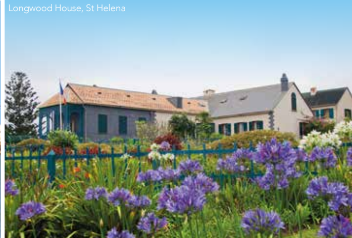
Longwood House, St Helena