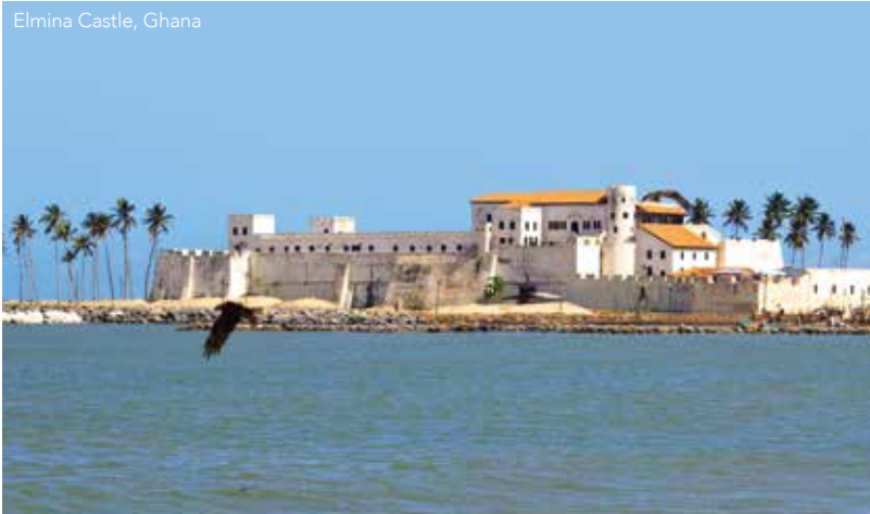
Elmina Castle, Ghana