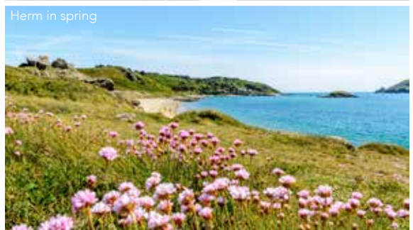
Herm in spring

and beaches and visit the Little Chapel, built in 1914 as a miniature version of the famous basilica at Lourdes and covered in fragments of shattered china, or join a cliff walk along the scenic coastline. We will sail the short distance to Herm, the smallest inhabited Channel Island and, at just one and a half miles long and half a mile wide, perfect for exploring on foot. Here, you will have free time to explore, perhaps take a stroll over to Shell or Belvoir Beach whilst our naturalists will be ashore on the lookout for wildflowers and birds. On Alderney, visit the island's only town, St Anne, which has all the old-world charm of a Normandy village with tiny squares and pastel shaded cottages and shops. Maybe join a short walk to see the German fortifications or a longer walk with our naturalists heading to the cliffs to see the abundant birdlife. At Sark we will use our Zodiacs to