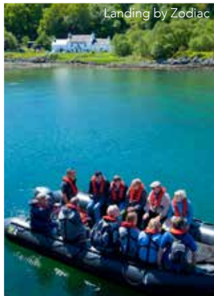
Landing by Zodiac