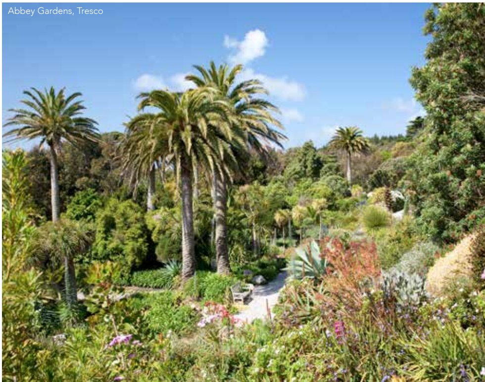
Abbey Gardens, Tresco