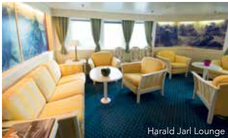
Harald Jarl Lounge