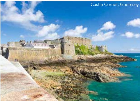
Castle Cornet, Guernsey